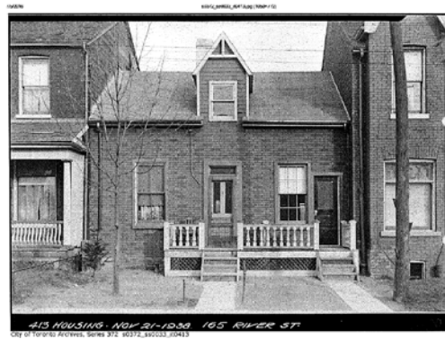
165 River Street in 1938, after alterations