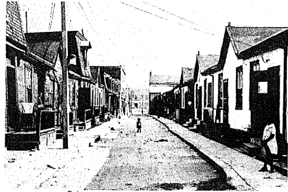
Gilead Place, 1936. A typical street of small houses in Cabbagetown. In 1919, the city directory listed simply "Macedonians" or "Foreigners" for some of the people living in these cottages. -City of Toronto Archives-D.P.W. 33-62