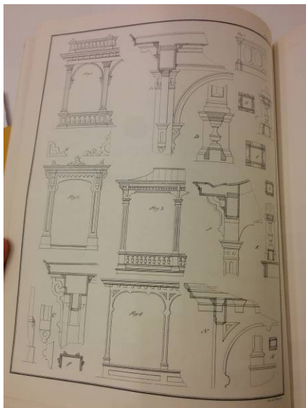
Plate 33- Designs for Porches from Cummings' Architectural Details-Containing 387 designs and 967 illustrations of the various parts needed in the construction of buildings, public ... houses, stores, cottages, and other buildings , 1873