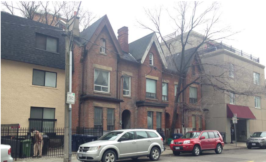
Showing the principal (west) elevations of 51A, 53, 53A Mutual Street (above) and the row houses in context (below)