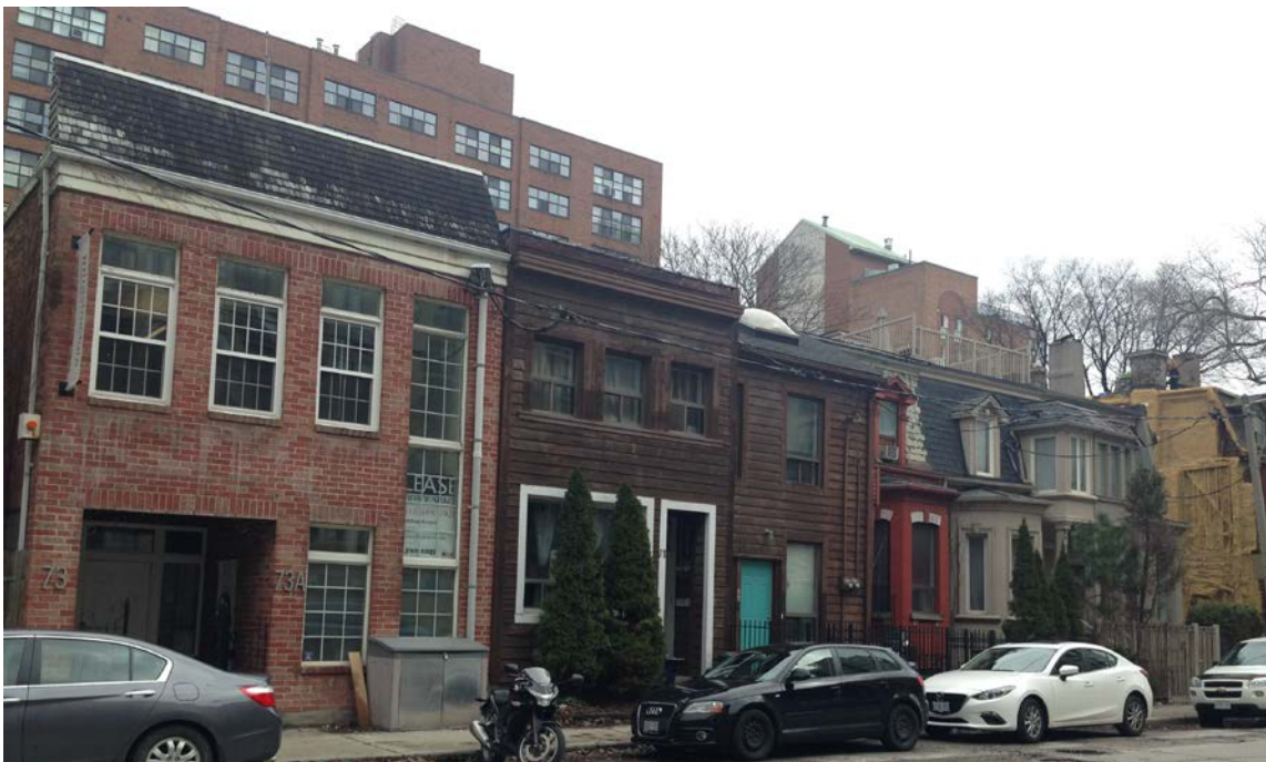
Showing the principal (west) elevations of 63, 65, 67 Mutual Street (above) and the row houses in context (below) ( Heritage Preservation Services, 2016 )