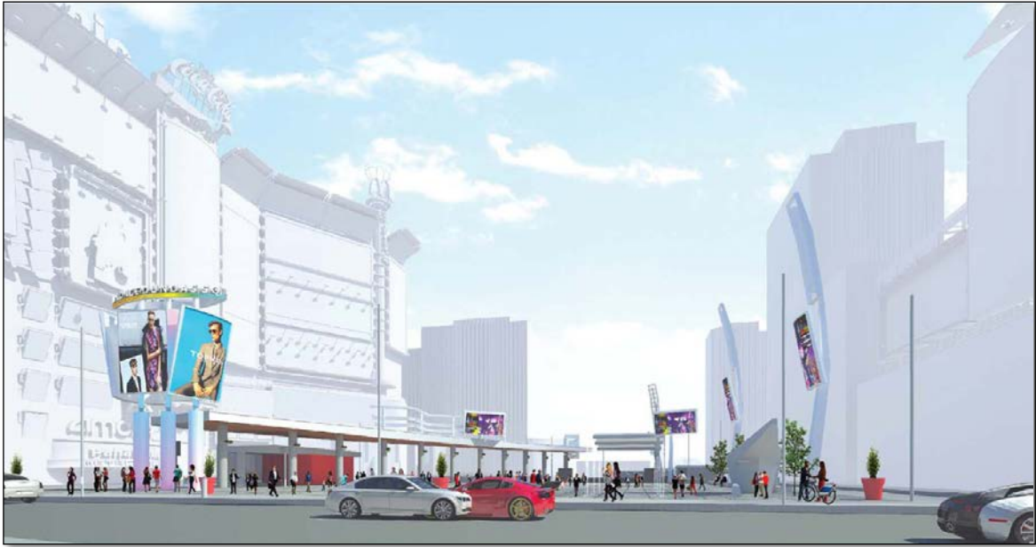
Figure 3 - Front and Rear of Proposed Signs D, F, and G