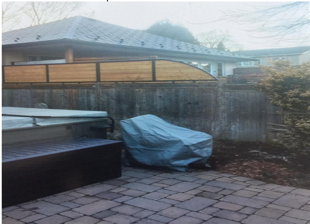
Attachment 2: North side of Property in rear yard abutting 67 Princeton Road

Staff Report for action on Fence Exemption – 65 Princeton Road