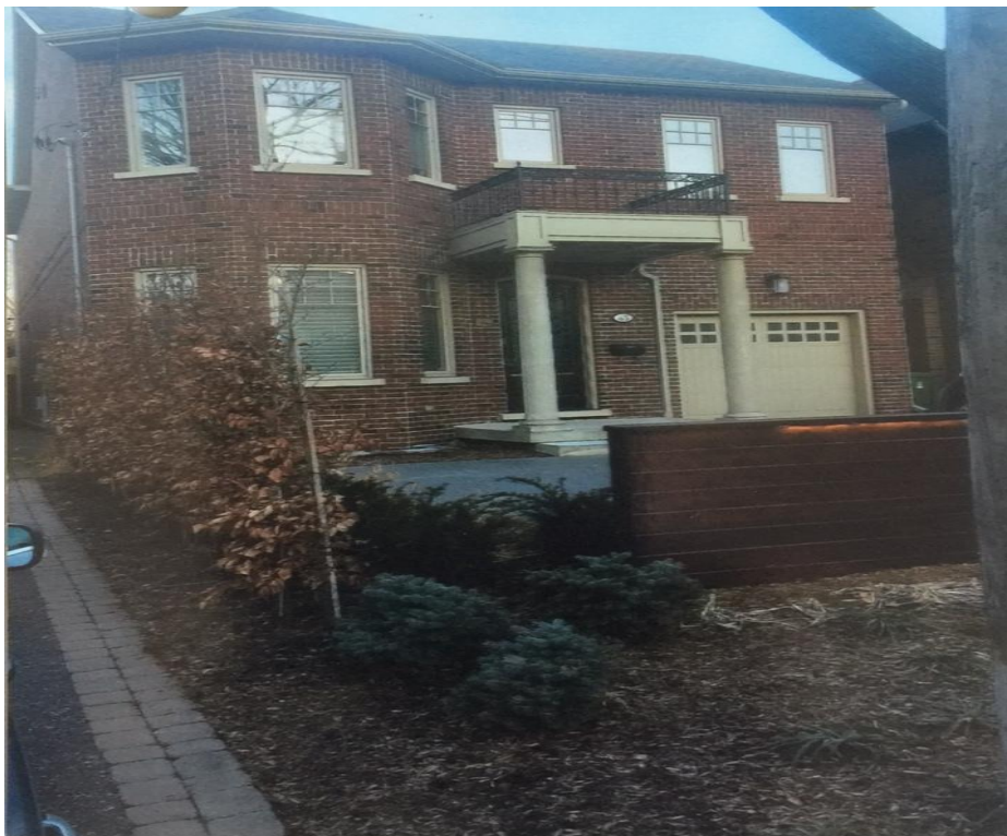
Attachment 4: Hedge adjacent to neighbouring driveway

Staff Report for action on Fence Exemption – 65 Princeton Road