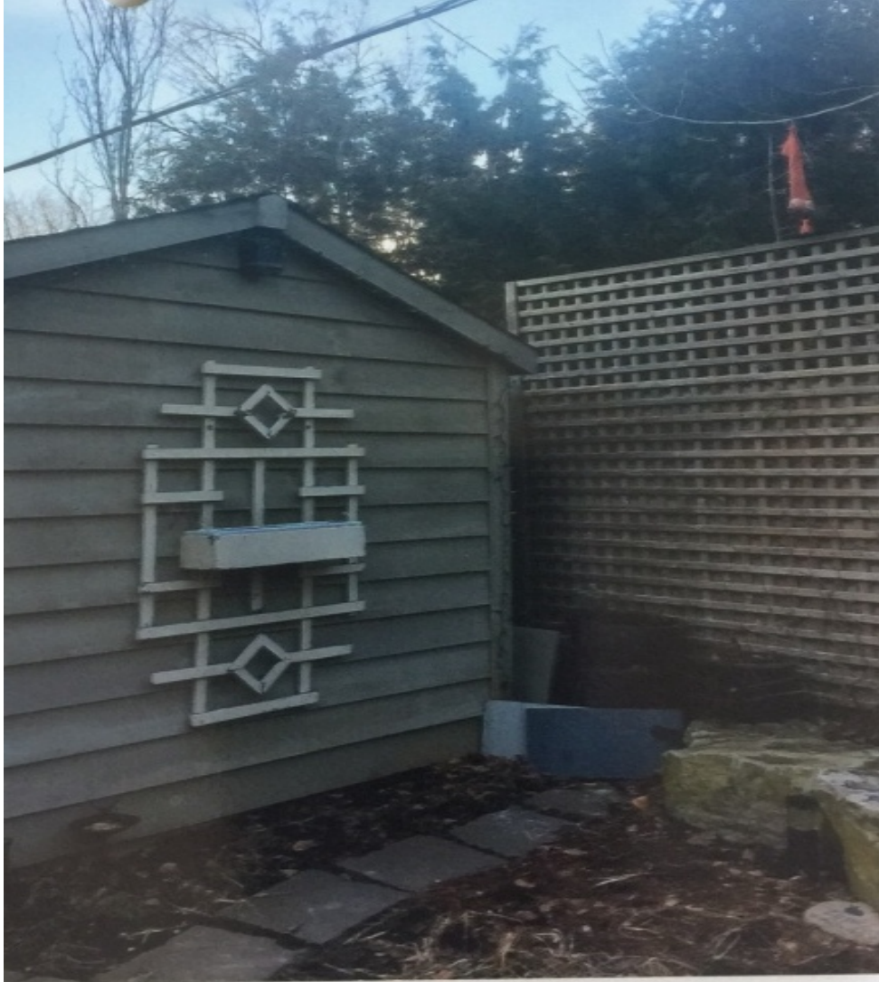
Attachment 5: Rear east facing fence abutting 1078 Royal York Road