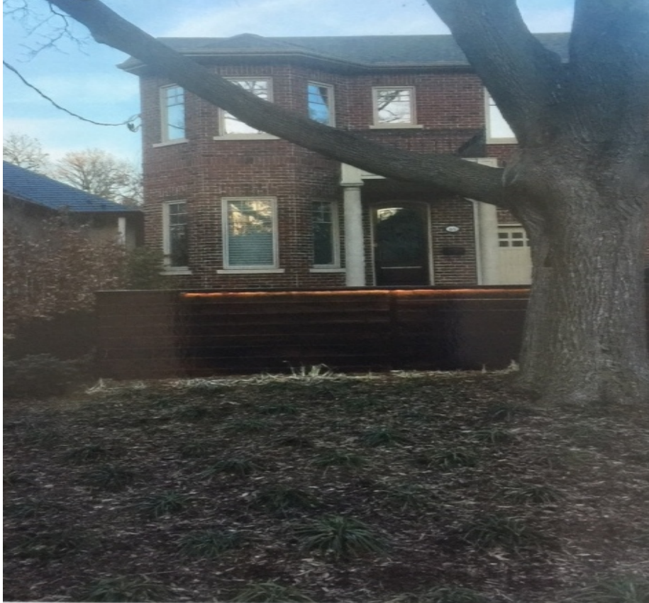
Attachment 3: Front Yard – Board on Board wooden fence