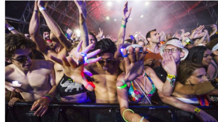
Make Music Day, the free global festival, returns in June to 50 cities across America.

Annual global event returns June 21st honoring Ella Fitzgerald, Otis Redding and more