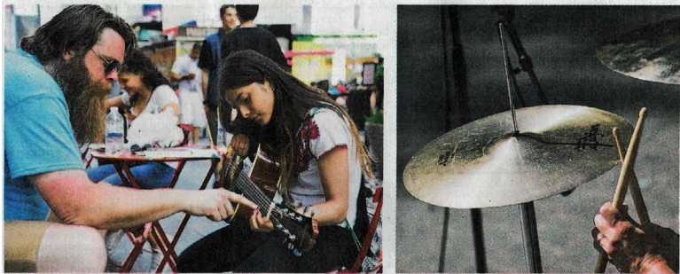
NOTABLE EVENTS: Pianists performed in the West Village Tuesday, top, as part of Make Music Day, a national initiative featuring free, outdoor music. Above, from left, a guitar lesson in Times Square and cymbals in Madison Square Park. More photos at WSJ.com/NY.