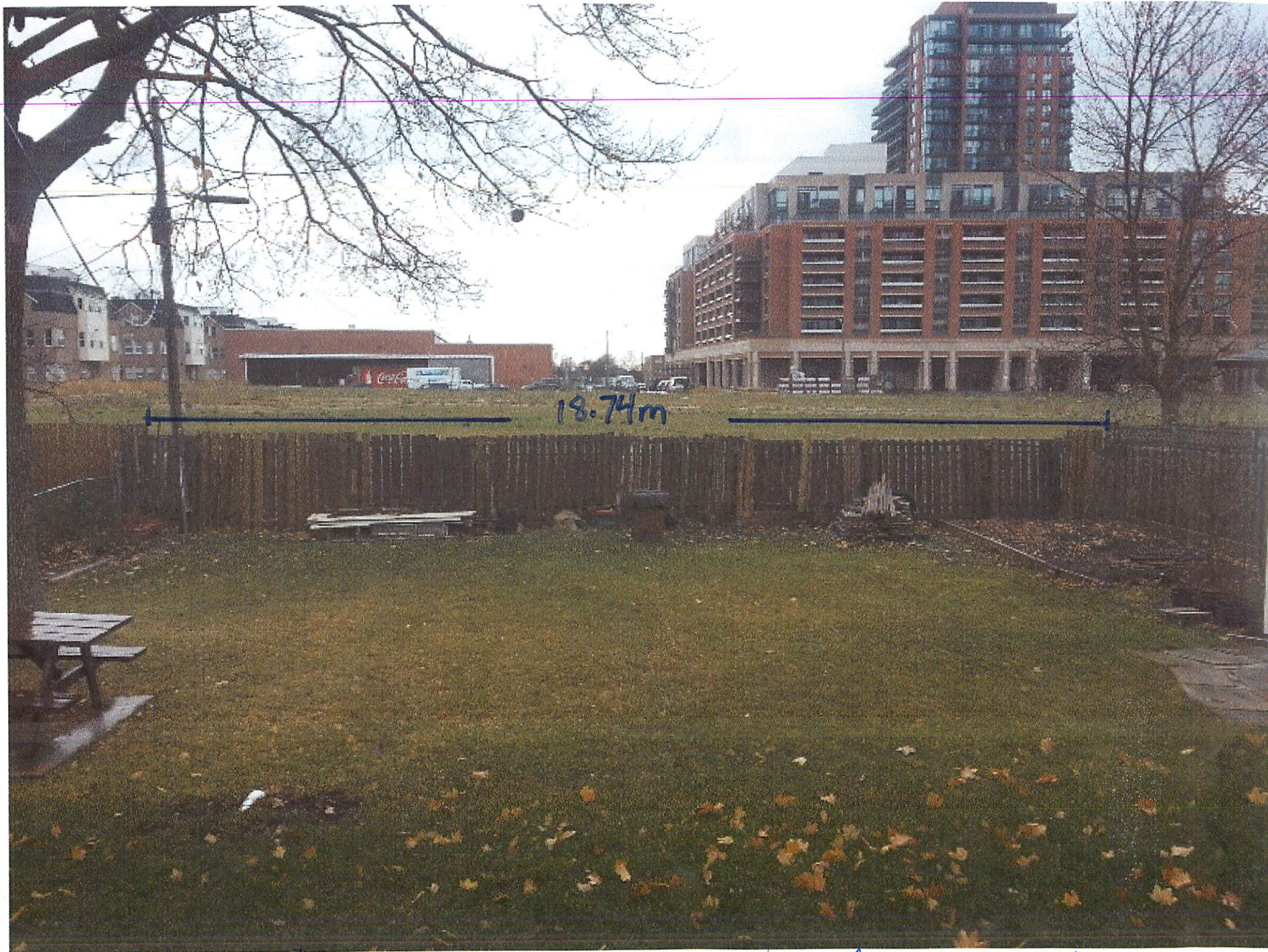
Attachment # 3 - Photo of entire area where fence is proposed