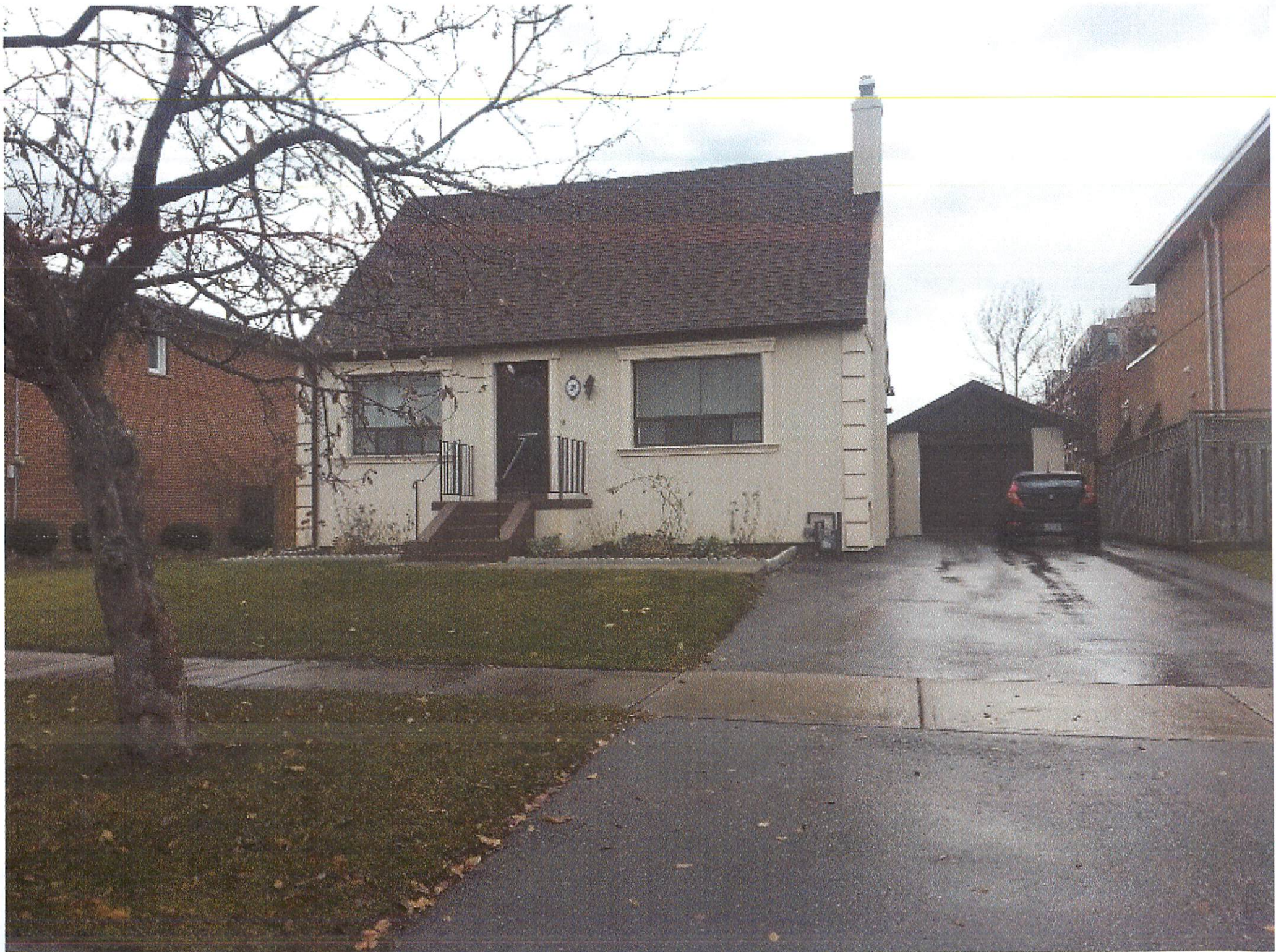
Attachment #2 - photo of front of 29 Dane Ave .