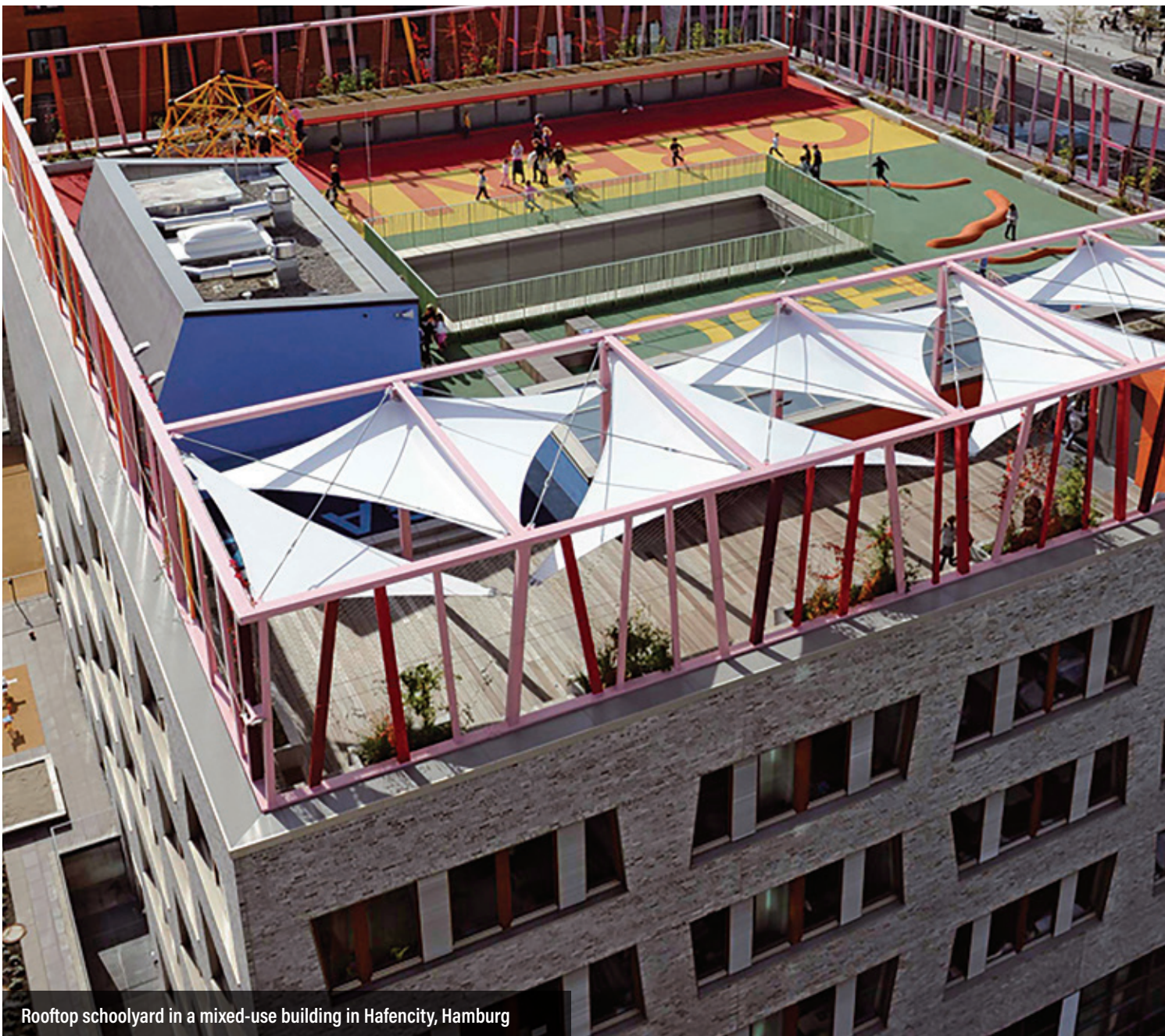
Rooftop schoolyard in a mixed-use building in Hafencity, Hamburg

community infrastructure, whether co-located with other facilities or integrated in new mixed-use buildings will be provided with frontage on major streets and have good visibility and access. Linkages to/from community infrastructure will be provided to pedestrian and cycling networks. Community infrastructure will also have good accessibility to public transit.