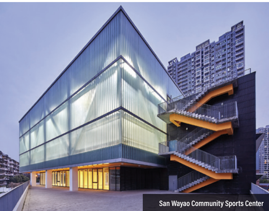
San Wayao Community Sports Center

The history of planning for a multi-sport facility in the Port Lands dates back to 2004, when the Federal government allocated funds toward its construction. Since that time, various options have been presented for the size, design and location of a multi-sport facility. In 2011, City Council directed that The Hearn Generating Station be considered as a potential location for a multi-sports complex. At a minimum, a twin-ice pad with ancillary uses is needed. A facility in the Port Lands should also provide the opportunity for other community programming and non-ice sports uses. Three potential locations have been identified for this complex.