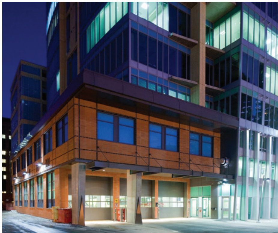
Louise Fire Station No. 6 in Calgary, Alberta integrated in a mixed-use development

Toronto Fire Service indicated the need for a new fire station in the Port Lands. As previously noted, this station would not only serve the Port Lands, but also new emerging communities elsewhere along the waterfront. The Fire Station would need to be located north of, or adjacent to, Commissioners Street.