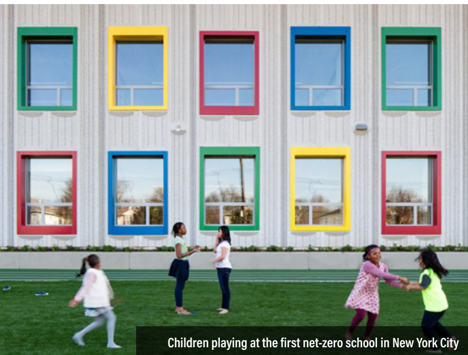
Children playing at the first net-zero school in New York City

The Strategy included consultation with human services agencies and detailed review with a technical advisory committee comprising: Emergency Services (Fire, Police, EMS), school boards, Toronto Public Library, Children's Services (child care), Parks, Forestry and Recreation, Economic Development and Culture, and Public Health. The Strategy was tested through public and stakeholder consultation, which led to overall improvements and refinements to the initial Strategy, leading to the recommendations presented in this Framework.