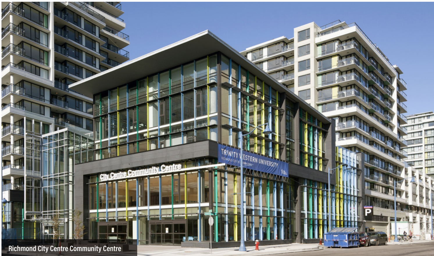
Richmond City Centre Community Centre