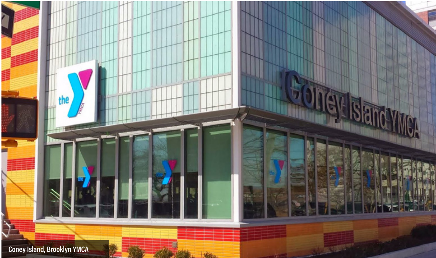
Coney Island, Brooklyn YMCA