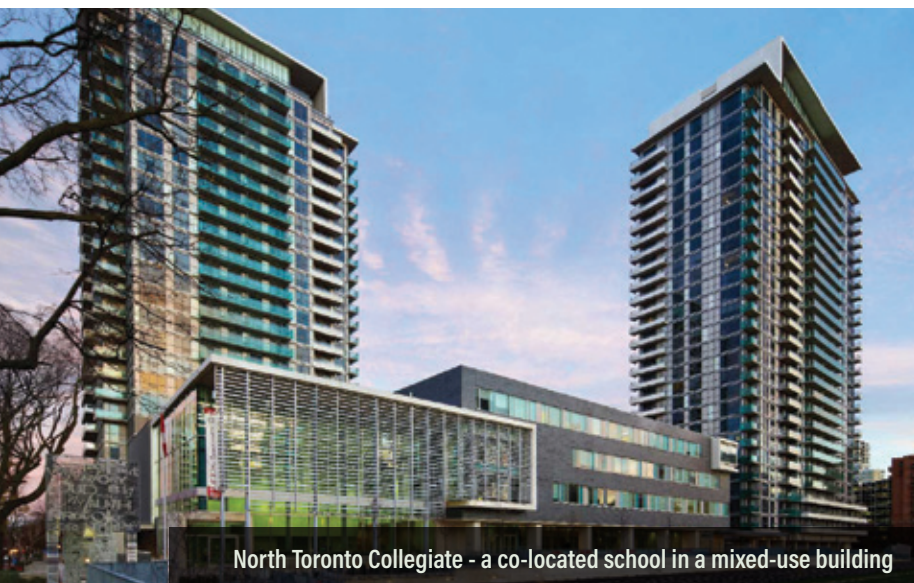
North Toronto Collegiate - a co-located school in a mixed-use building

infrastructure should also be strategically located to both serve the needs of residents and workers, but also to capitalize on opportunities for improving public access across the Port Lands geography.