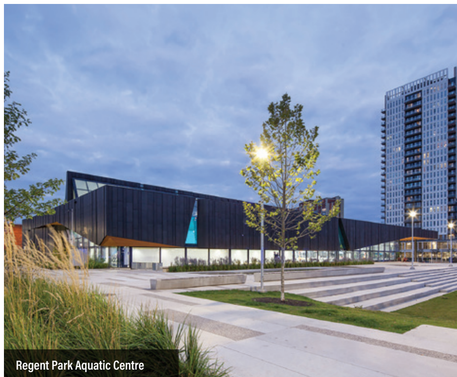
Regent Park Aquatic Centre

While one community recreation centre is generally required in each community, this is not optimal from an operating perspective. One large community recreation centre with a minimum floor area of 4,650m 2 (50,000 square feet) coupled with a small community centre and neighbourhood library that provides space for a range of different services and programs would ensure each new and potential community has the necessary infrastructure. This also enables a range of infrastructure to be distributed across the Port Lands and affords the City with flexibility and greater efficiencies.