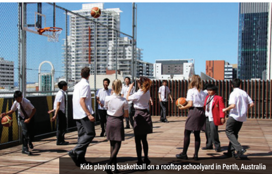
Kids playing basketball on a rooftop schoolyard in Perth, Australia

While it's important to create hubs of activity, it's equally important to geographically distribute community infrastructure across the Port Lands to ensure good access to services and facilities. Some community