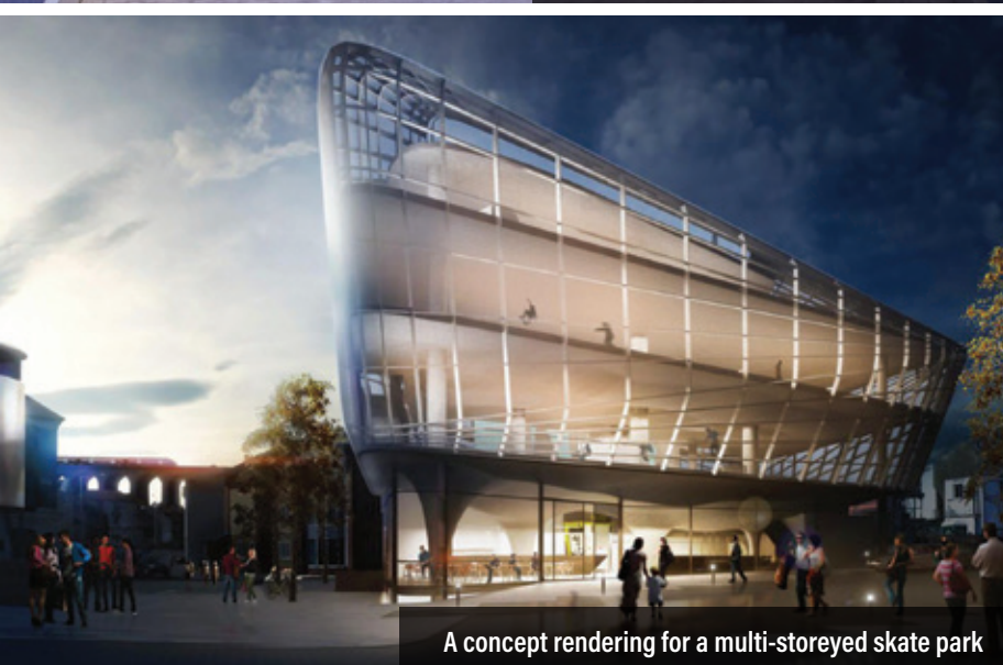
A concept rendering for a multi-storied skate park