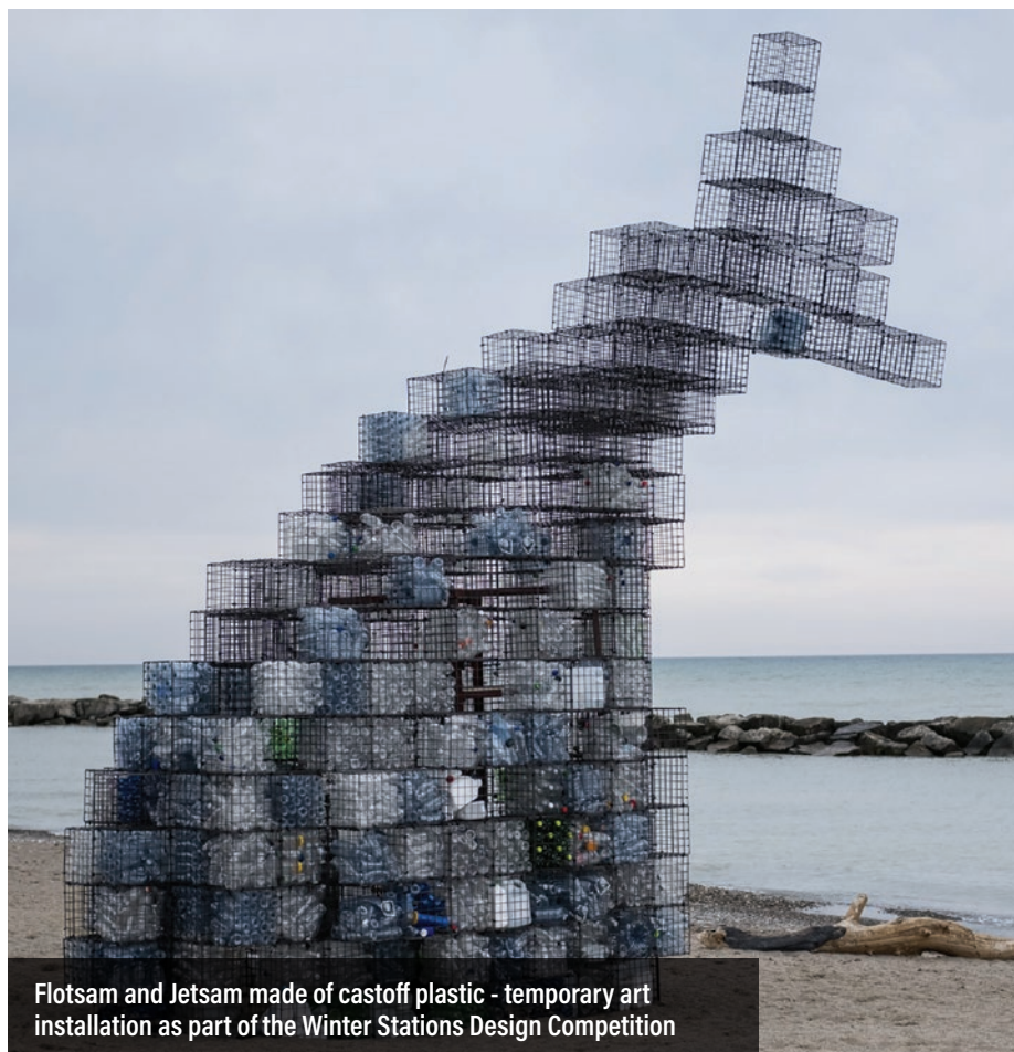
Flotsam and Jetsam made of castoff plastic - temporary art installation as part of the Winter Stations Design Competition