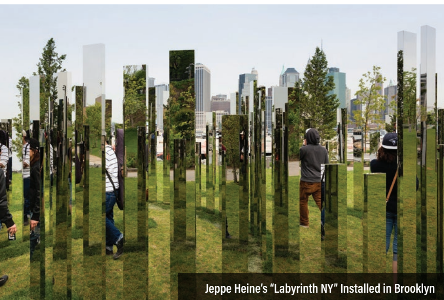
Jeppe Heine's "Labyrinth NY" Installed in Brooklyn

While temporary public art is an important part of the overall conceptualization of public art in the Port Lands, alternative funding sources and partnerships for temporary public art works are required. These types of installations and works are not eligible to be funded through the use of Section 37 under the Planning Act or from contributions associated with major capital works. Alternative funding sources could include grants, philanthropy or sponsors.