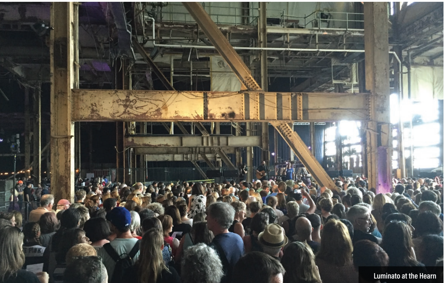
Luminato at the Hearn