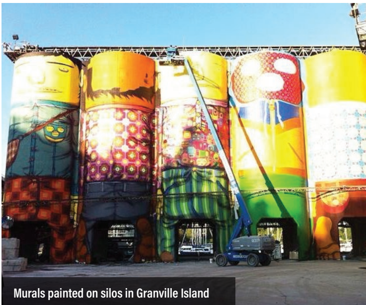
Murals painted on silos in Granville Island

The many iconic heritage buildings and cultural landscapes will become catalysts for revitalization and redevelopment. Further, the Destination and/or Catalytic uses proposed are envisioned as major cultural or institutional uses that will have unprecedented potential to draw people to the area.