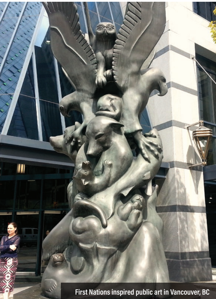
First Nations inspired public art in Vancouver, BC

The celebration of water is a central theme of the Framework, including the recognition of waterways not found elsewhere in the city. Equally important is the recognition of the Port Lands as Toronto's historic port area and the sole remaining operating port. Public art adjacent to, or in, the waterways, such as the Keating Channel and Ship Channel, will showcase and tell Toronto's working harbour story and its role in the development of the city.