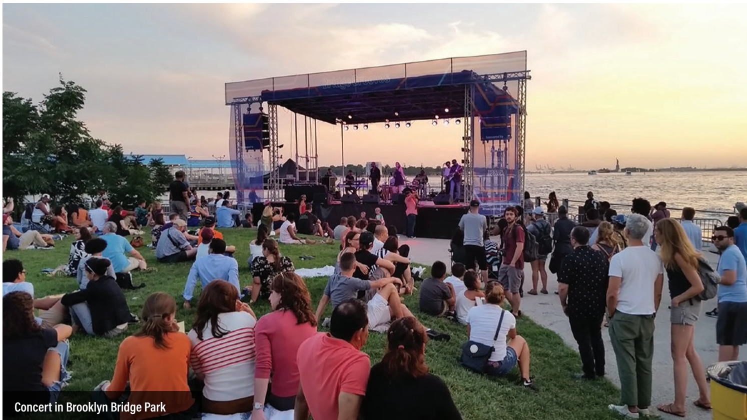
Concert in Brooklyn Bridge Park

The design of major parks and open spaces will consider opportunities for hosting large, public cultural events and festivals, and other opportunities that capitalize on the Port Lands assets for cultural events will be identified. The development of affordable accommodation for artists and studio workspaces for creative practitioners will be encouraged and promoted. This will not only ensure further opportunity to diversity the future population, but also give rise to additional enterprise and employment in the creative sector.