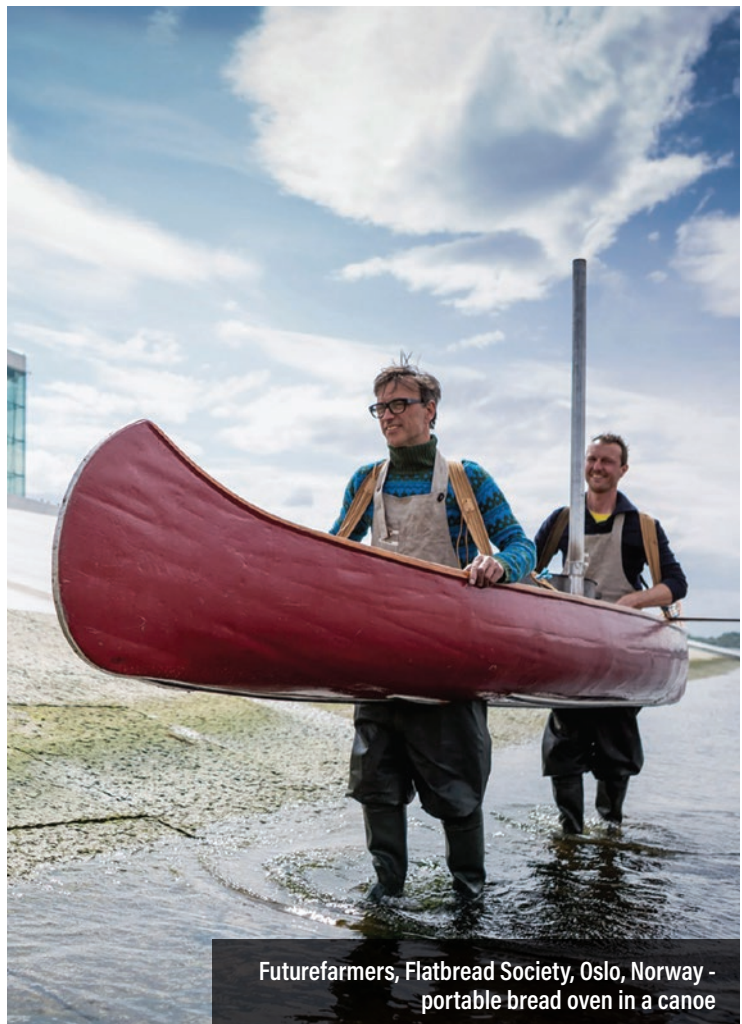
Futurefarmers, Flatbread Society, Oslo, Norway - portable bread oven in a canoe