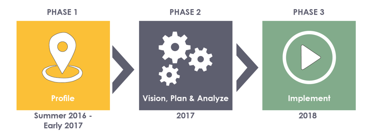
Figure 1 - Don Mills Crossing Phases

Over the next year and a half Don Mills Crossing will answer key questions about what is needed to build a complete, well connected and walkable community at Don Mills and Eglinton. Building on Eglinton Connects, the work necessary to achieve this goal will be undertaken over three phases as outline in Figure 1.