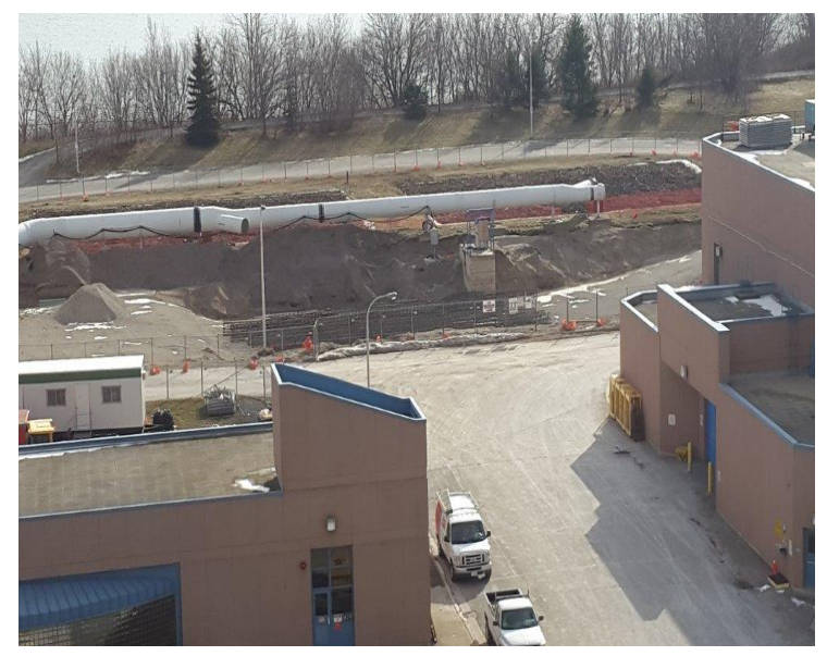
c) Foul Air Inlet Piping Installation

b) Roof Top Membrane on Biofilter Building