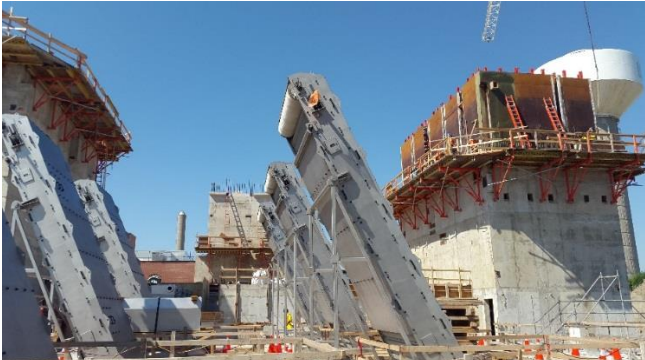
c) Influent Screen Installation within P Building