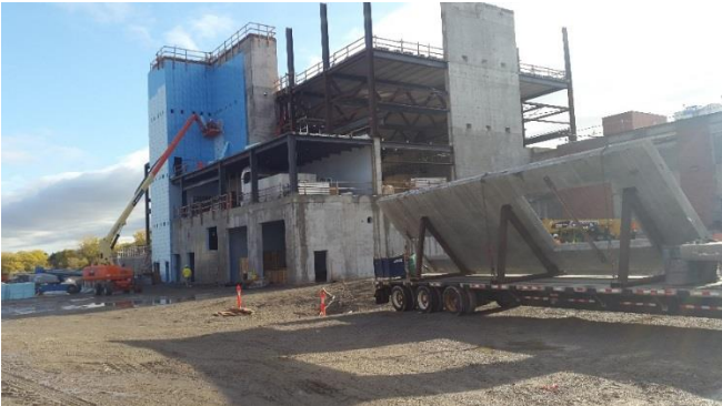
b) P-Building Outer Building Shell