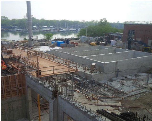
d) Partial Overhead View of P Building