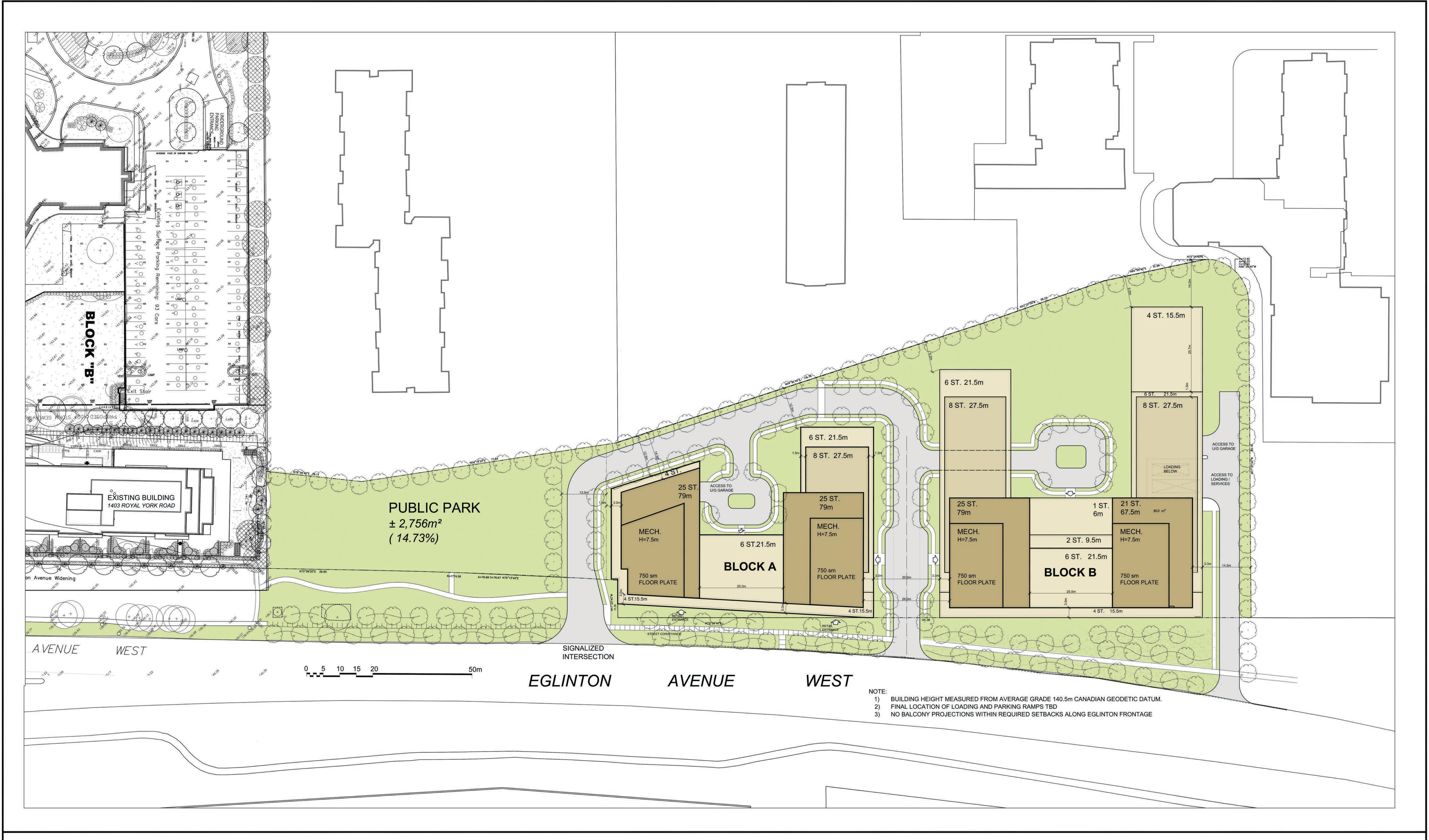
CC36.5 - Confidential Appendix B - made public on February 6, 2018

LANTERRA 4000 EGLINTON REALTY LIMITED MIXED USE DEVELOPMENT 4000 EGLINTON AVENUE WEST, TORONTO