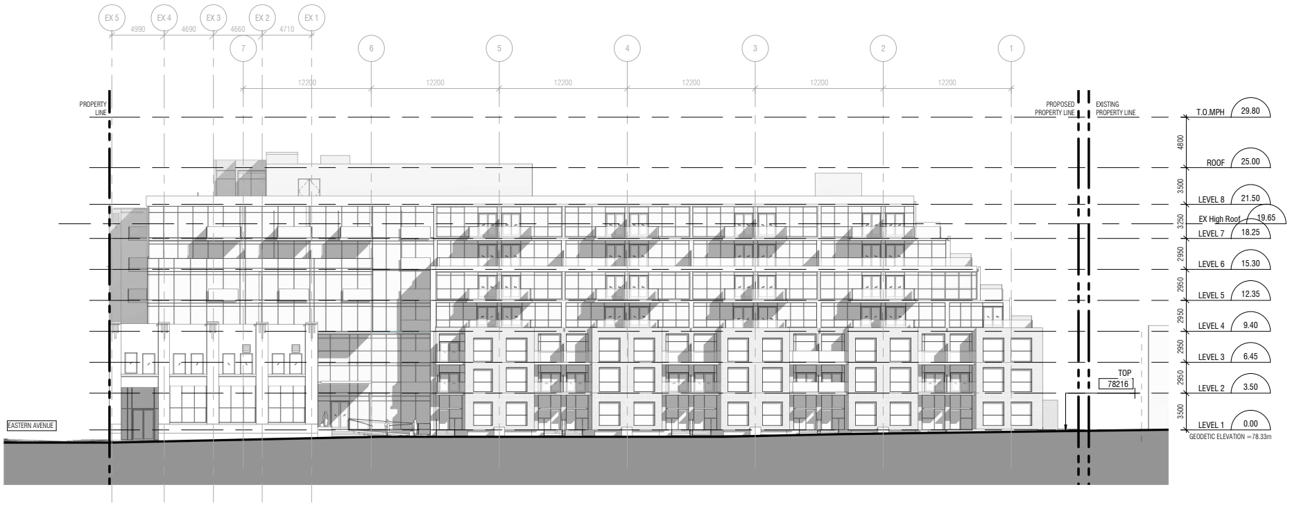
1 EAST ELEVATION SK-A302-1 1 : 500