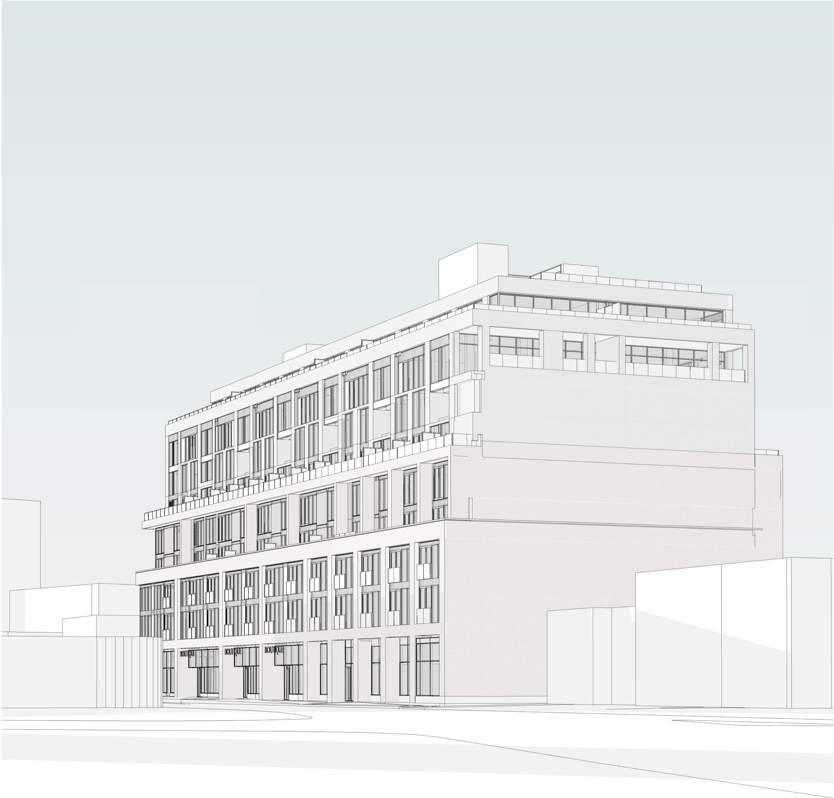
3 STREETVIEW FROM DUNDAS LOOKING WEST