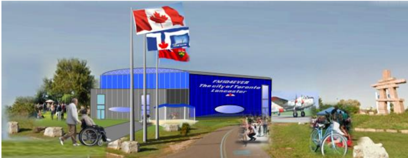
Remembrance Dr. Coronation Park

Summary – Our group is 5 months behind everyone else, because only museums were contacted by the City - the public was totally unaware.