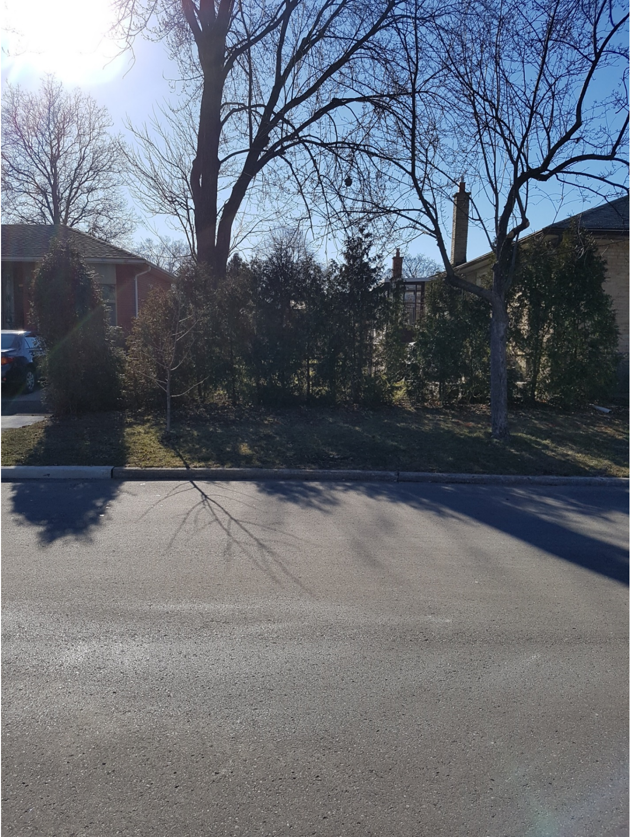
Attachment 3: Area for Proposed Front Yard Fence of 19 Hamlyn Crescent

Staff Report for action on Fence Exemption - 19 Hamlyn Crescent