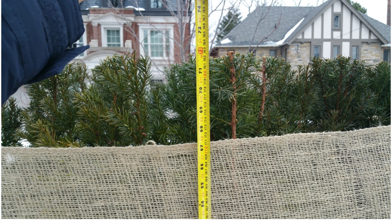
Attachment 3: Front Yard Fence of 33 Kingsway Crescent with Measurements