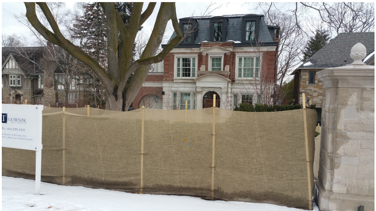
Attachment 2: Front Yard Fence of 33 Kingsway Crescent

Staff Report for action on Fence Exemption - 33 Kingsway Crescent