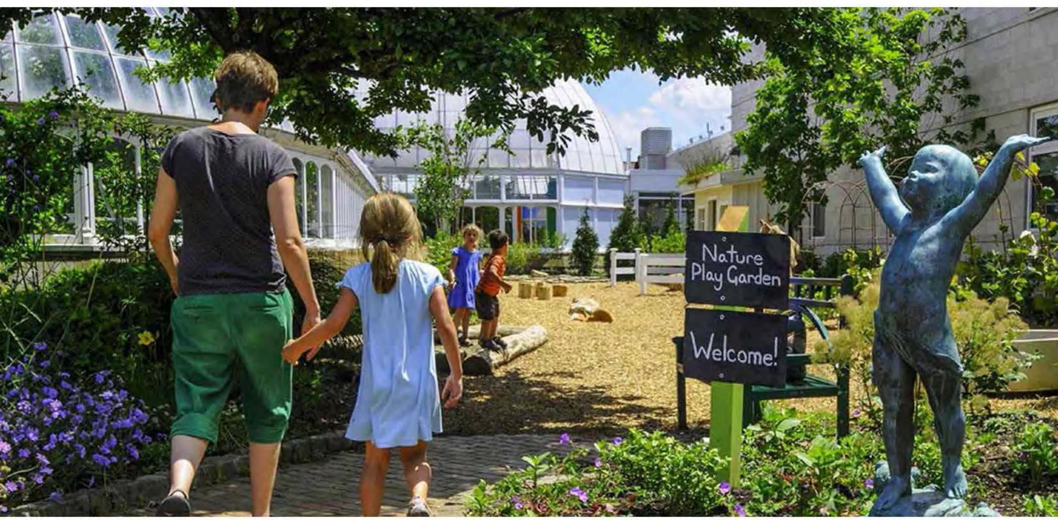
Children's Discovery Garden Phipps Conservatory, Pittsburgh