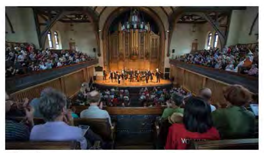
Tafelmusik Trinity St. Paul's United Church - Toronto, ON

While previous master plans and reports have not addressed connections with the surrounding churches, community consultation encouraged exploration of these relationships. There are a number of religious buildings in the immediate vicinity of Allan Gardens, and most are housed in significant heritage structures. Their architectural appearance, especially the three copper-clad steeples that mark all but one corner of the Gardens, contributes greatly to the context of the park, but more importantly, the churches perform vital public services for the wider neighbourhood. Two historic churches - the Jarvis Street Baptist Church and Grace Toronto Church - share the block with the Gardens, while St. Luke's United Church and the Paroisse du Sacré-Cœur form part of the street edge on the periphery, and St Peter's Anglican Church is one block away. The potential exists to learn more about the programs run by the various congregations and seek opportunities for collaboration with the park revitalization. As places of assembly, the churches may serve as convenient locations for holding meetings or classes related to the park, either informally or on a regular basis. Congregations should also be encouraged to participate in events in the Gardens.