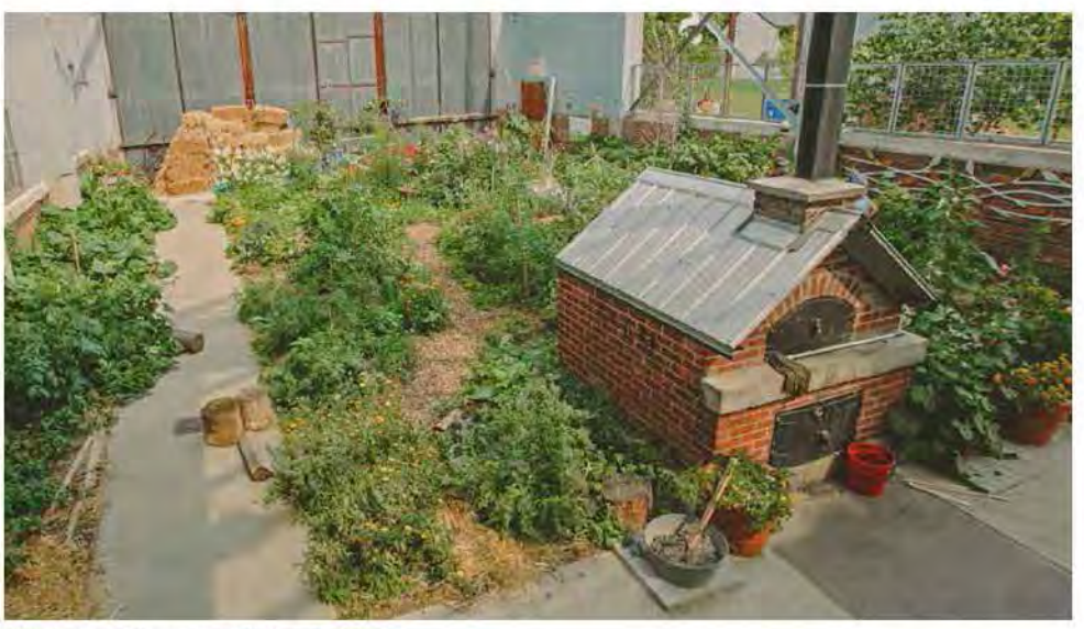
Wychwood Barns - Children's Garden Toronto, ON

With the new, enclosed playground in Jarvis Terrace (near Horticultural Ave.) a feature specifically for children's use has been added to the Gardens. Drawing lessons from other successful conservatories, such as Phipps in Pittsburgh, Allan Gardens could further appeal to families and children by offering a range of complementary child oriented spaces and programs. Imagine a whimsical series of garden spaces that engage the senses at the scale of a child, and programs to teach children to appreciate nature. A new Children's Garden would most likely be situated south of the Children's Conservatory, in close proximity to the playground, the Greenhouse Link, and the Washroom.