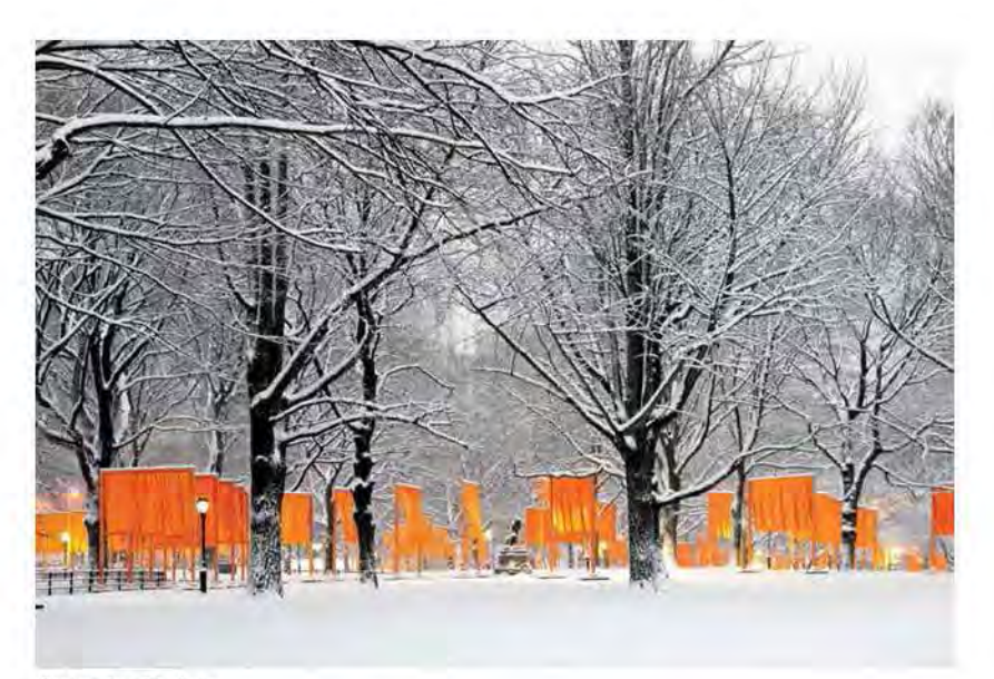
Gates by Christo Central Park, New York

Temporary or seasonal public art displays can re-animate and recontextualize all areas of the Gardens, including within the Conservatory, and attract and engage more visitors. In addition to London's Serpentine pavilion (where an innovative new pavilion is designed by an emerging architect every year) and New York's PS1 Young Architects Program, New York's Madison Square Park has an excellent program of engaging public art, usually large-scale sculpture. Winnipeg's warming huts and Toronto's Winter Stations competitions are good models for popular and fun winter shelters. Flexible partnerships with arts groups and cultural communities are key to the realization of the pieces. In Allan Gardens these installations could have a horticultural theme or engage the vegetal world in a creative, educative way, similar to the Mosaïcultures Internationales in Montréal.