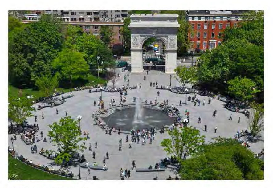
Washington Square Park New York, NY

In order to encourage existing and future cultural uses in the park (see Opportunity 1.1), and to enhance the park as a setting for more informal "receptive" forms of outdoor activities, existing spaces within the Gardens should be enhanced. The Palm House Terrace can be better defined as a civic living room within the park through improvements to edge plantings, improved seating opportunities, and through the provision of services (such as electricity and water) to allow for events. The historic portico can be re-built as an architectural backdrop to the terrace, and decorative light fixtures can enhance the