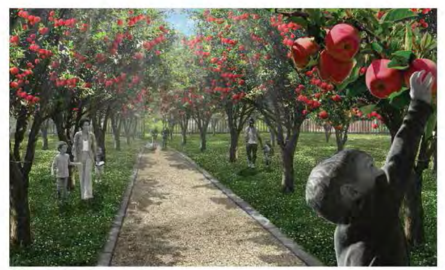
Urban Orchard Project Proposal, Memphis, TN

The west side of Allan Gardens facing onto Jarvis Street ('Jarvis Terrace' in the plan), was acquired incrementally by the City after the relocation of the Jarvis Collegiate Institute in the 1920s. For that reason, Jarvis Terrace is not well integrated with the Garden's original formal organization east of the Palm House. The Conservatory divides the open space of the park, and the newer additions of the Children's Conservatory and more recently the Children's Playground, result in a lack of clear, integrated routes from Jarvis Terrace to the Arboretum. While there is a path along the north side of the greenhouses, there is no direct connection between east and west on the Gardens' south side. A Greenhouse Link Building (see 3.1) would animate and define Jarvis Terrace, and provide the wing greenhouses with a formal western face and an entrance from Jarvis Street. New exterior pedestrian routes, such as a path from Jarvis Street to the Link Building, a route linking to Horticultural Lane (considered in the 2001 "Market Research/ Financial Viability Study for Allan Gardens"), and a formal connecting path defined by a pergola should be explored. This greater connectivity would allow a more active use of Jarvis Terrace.