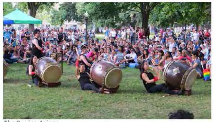
The Raging Asians Dyke March, Allan Gardens

Allan Gardens has long served as a venue for important cultural activities, a locus of activism and civic engagement, and a site for ceremonial and sacred uses. Reflecting this social history, page 10 lists some of the significant events that have occurred, and in some cases continue to take place, in the Gardens. As Allan Gardens is revitalized, programs for existing and additional cultural uses and ceremonies (involving for example dance, fire, smudging, music, drumming, and storytelling) should be encouraged and supported. Opportunity 3.3 proposes enhancement of spaces to accommodate these and other programs in the Gardens.