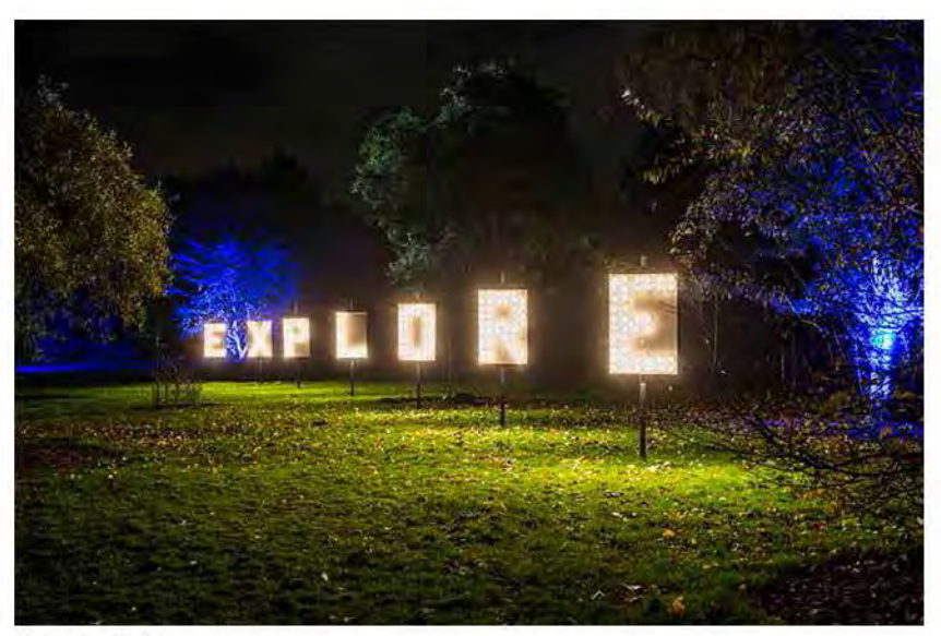
Botanic Lights Royal Botanic Gardens Edinburgh

Creative night lighting (of gardens, spaces, plants and architecture) would bring a new and adjustable ambience to the park, while extending its usable hours and enhancing safety. Light displays can be programmed seasonally (Harvest Party/ Halloween, Solstice events, Pride, etc.) or to align with a Nuit Blanche circuit. Cohesively designed lampposts, architectural illumination highlighting the Conservatory, lanterns in trees and gardens, and new path lighting can be programmed together for atmospheric effect and to define nighttime spaces in the Gardens, while contributing to security.