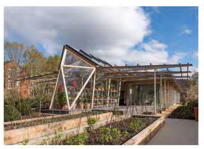
Maggie's Manchester Manchester, UK

The keystone idea of the Refresh, the construction of a Link Building would provide critical infrastructure for new programs, partnerships, and resources in Allan Gardens. Significantly increasing the amount of indoor space, the link could house horticultural programming such as new display gardens, demonstrations, classes, a rentable venue for events, and a café. These uses could foster new partnerships, attract many new and returning visitors, and generate revenue. With an entry and new program facilities adjacent to Jarvis Terrace, the Link would help to animate the Gardens' west side. Importantly, it would enhance the experience of the current greenhouse displays, connecting the existing north and south wings, establishing a complete circuit to improve visitor flow, and creating clearly defined courtyard spaces.