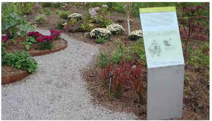
Garden Signs Toronto Botanical Gardens - Toronto, ON

Opportunities to encourage engagement with cultural, historical, and horticultural themes in Allan Gardens can be provided in a range of ways including a modern wayfinding and interpretive signage system. A comprehensive signage program will allow for independent exploration and navigation of the many specimens housed within the Conservatories, as well as specimen trees and plants in the Arboretum, North Grove, and Jarvis Terrace. The 2001 Market Research/Financial Viability Study observed that "interpretive signage, labeling, story-boards, hand-outs are virtually nonexistent." The 2004 Management Strategy called for a "unified signage system" for wayfinding as well as for conveying horticultural information and "messages of significance."