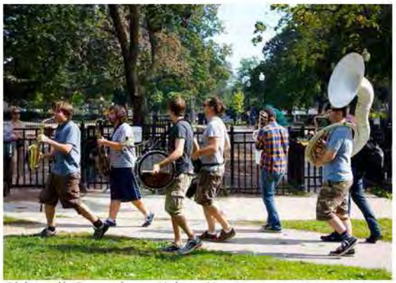
Sidewalk Crusaders - Urban Harvest Allan Gardens - Toronto, ON

Continuing Allan Gardens' long history as a setting for cultural gatherings, the park should serve as a venue for music and other performance art. The City's 2001 "Market Research/ Financial Viability Study for Allan Gardens" recommended that "artists should be involved with Allan Gardens, and music and art display programs expanded." To that end, classical concerts that have taken place in the Palm House should continue, and more formal recitals could be staged in the Children's Conservatory or in event spaces within the proposed Link Greenhouse (see 3.1). There are spatial opportunities for exterior performances: the Palm House Terrace could serve as a stage or seating for music, dance, or theatre, and be buffered from street noise with planting. Similarly, areas in the Arboretum or Jarvis Terrace (see Character Areas plan), enclosed or defined by planting and lighting, could shelter performances.