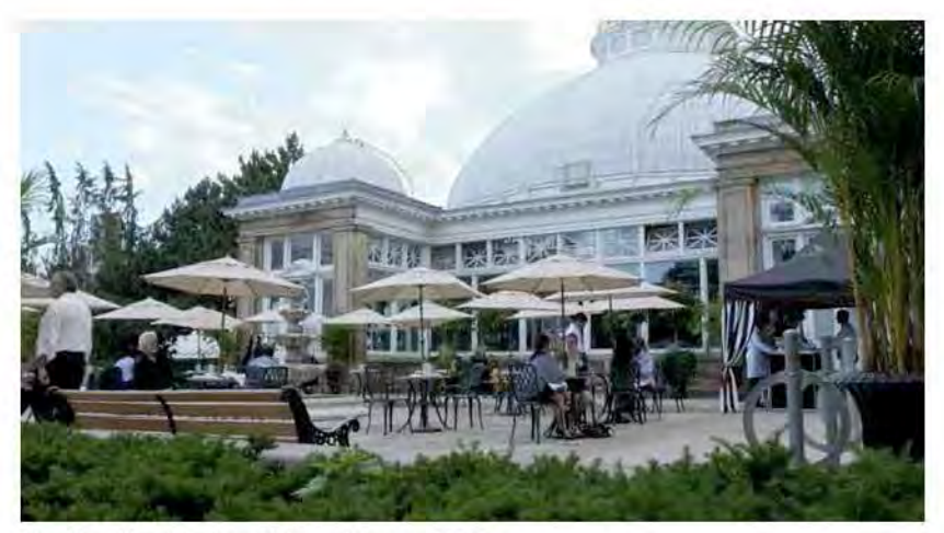
On-site Film Set, Imagining a Terrace Cafe Allan Gardens, Toronto