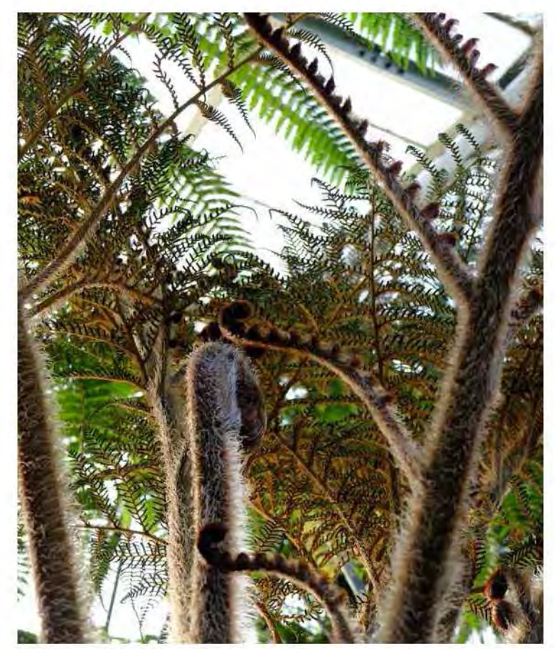
Multitudes of Species Royal BotanicGardens Edinburgh

A Tree Plan should also be developed which outlines a long range vision and clear management guidelines for the trees of Allan Gardens. The Plan would ensure that all efforts related to park trees (removals, maintenance, new plantings etc.) work toward a clear, consistent vision. Because of the horticultural history of the Gardens, and its existing inventory of significant trees, the notion of establishing an arboretum in a portion of the park could be an appropriate opportunity.