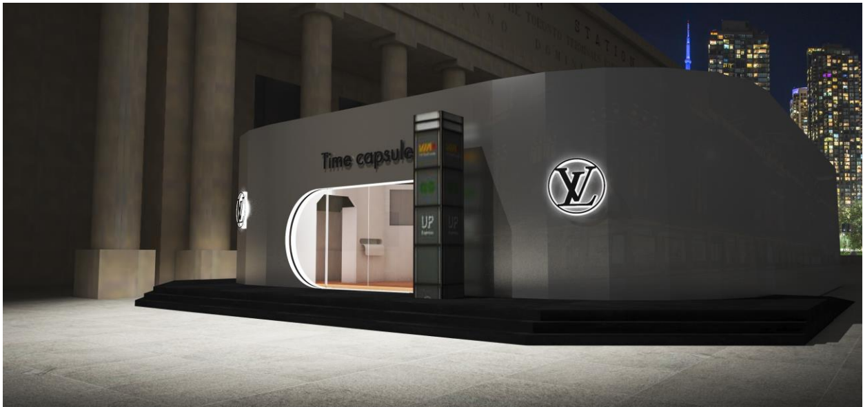
Image 1: Rendering of Louis Vuitton Time Capsule Installation at Sir John A. MacDonald Plaza.