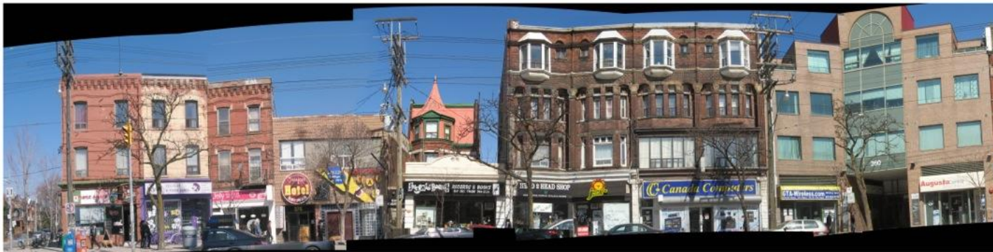
College North Borden to Brunswick