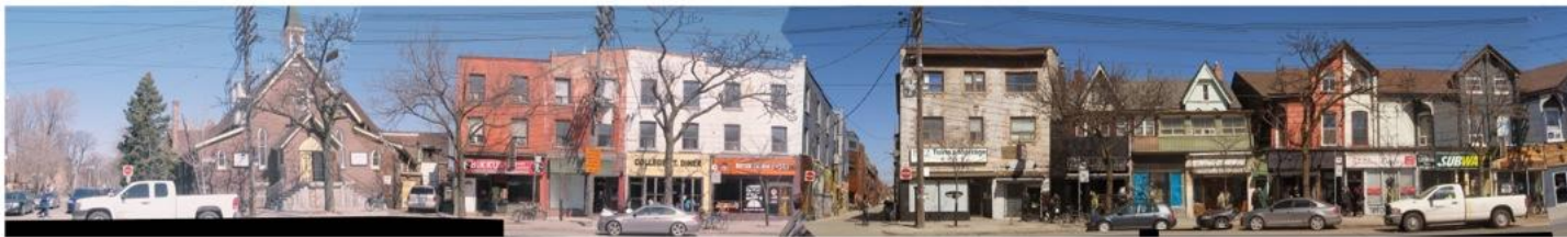
College St Lippincott to Borden