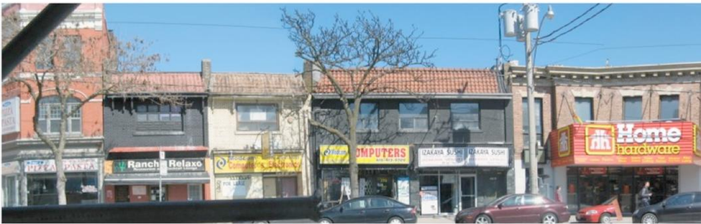
College N side-lane to Robert Street