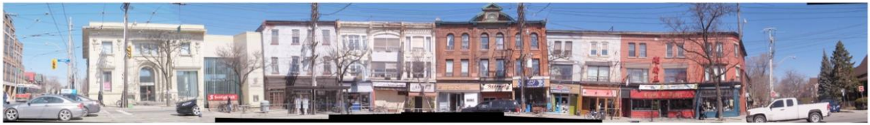
College St Bathurst to Lippincott

This was simply a great outcome where the community spoke and city staff listened, engaged, and acted.