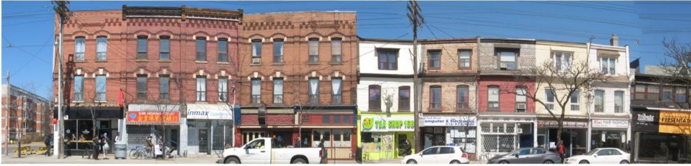
College St. N Robert to Major