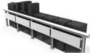
Publication Box Corral