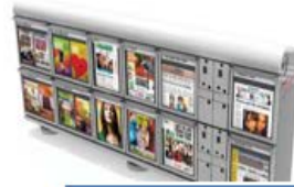
Publication Box Kiosk