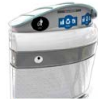
Litter Receptacle (Old)