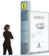
Information Pillar (Ad)