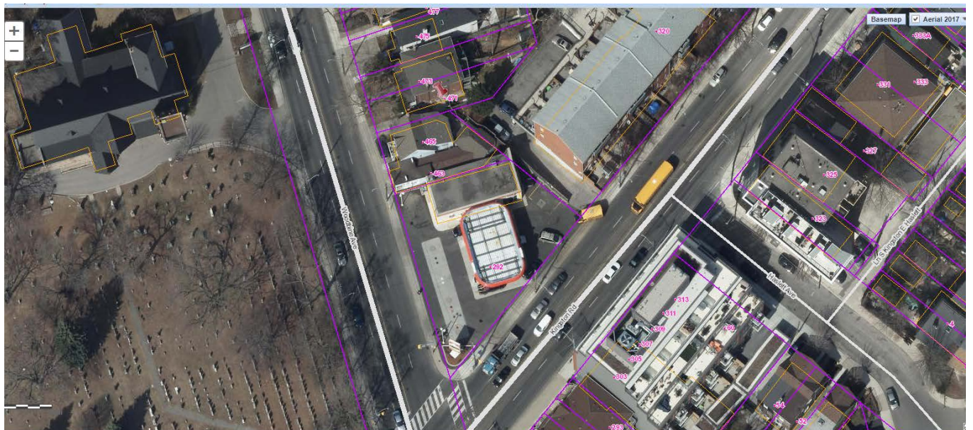
Attachment 1: iView Map of property – 471 Woodbine Ave