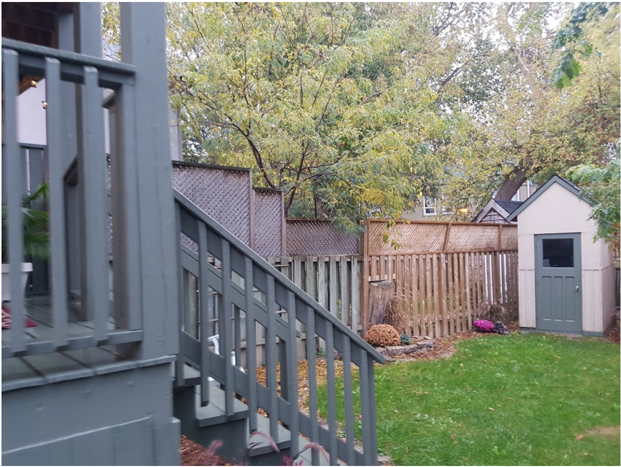
Attachment 2: Existing fence on North side of property (photo taken facing North East)