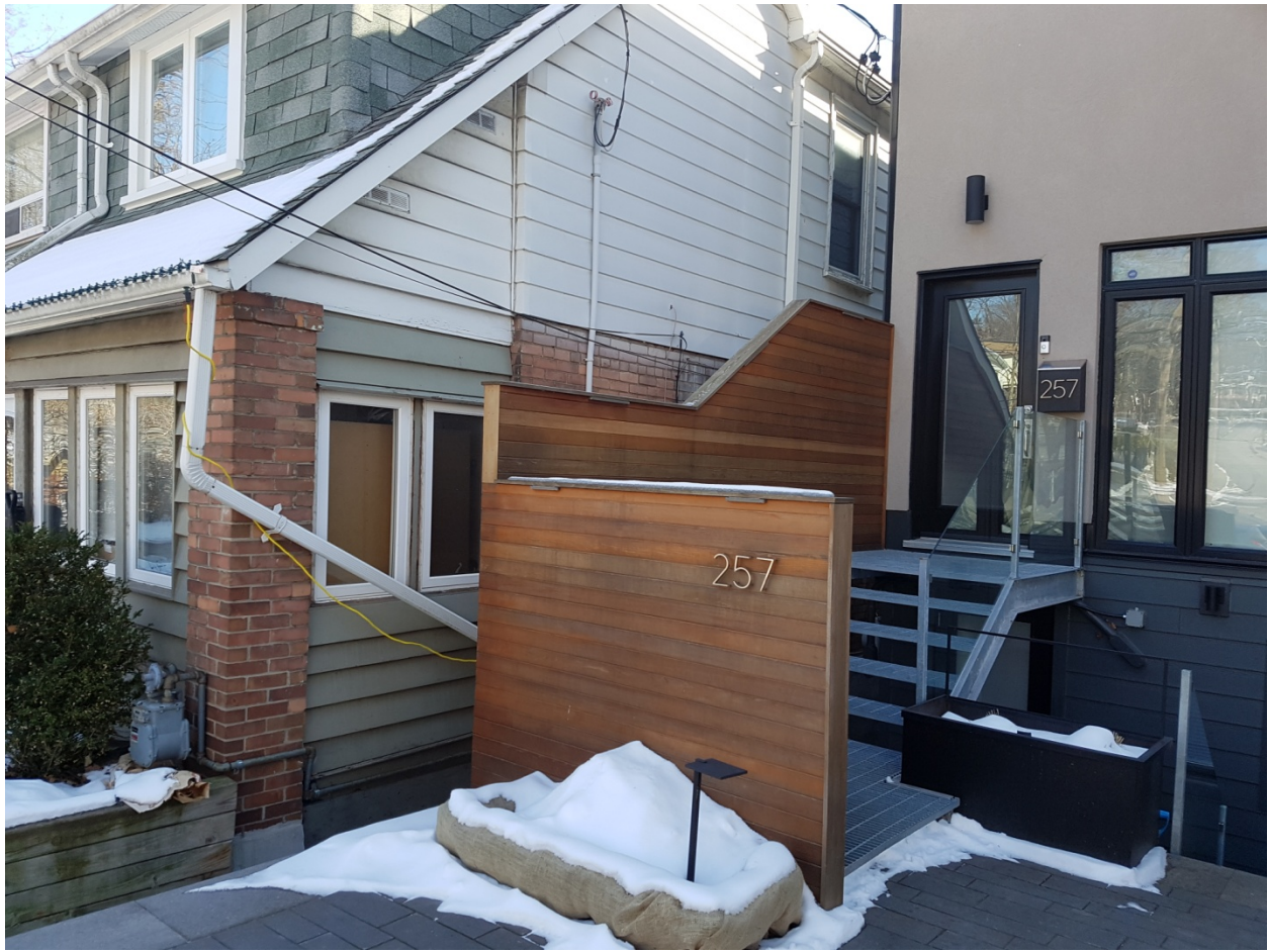
Attachment 3: Existing fence on the North side of property (photo taken facing south-east)