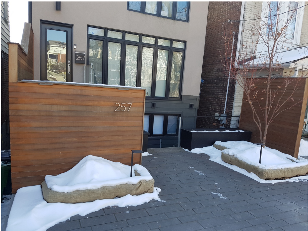
Attachment 4: Picture of West fence and North fence (photo taken facing South)