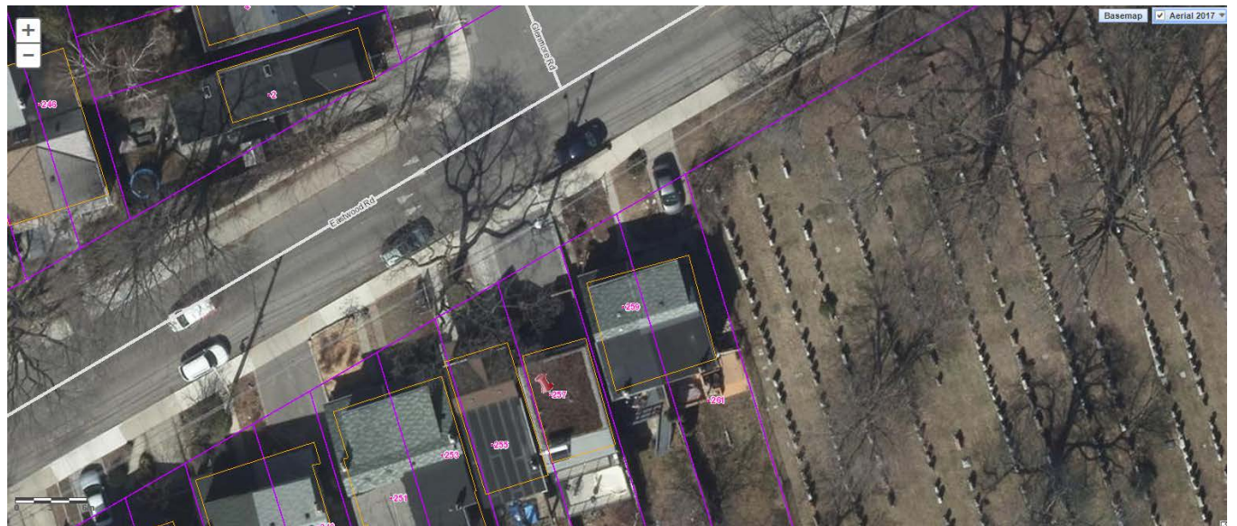
Attachment 1: iView Map of property – 257 Eastwood Rd