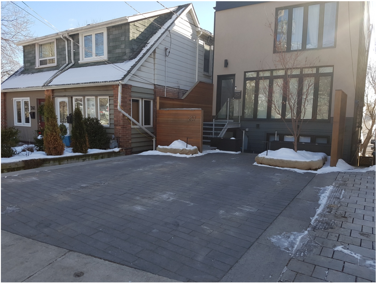
Attachment 2: Photo of property (taken facing South)