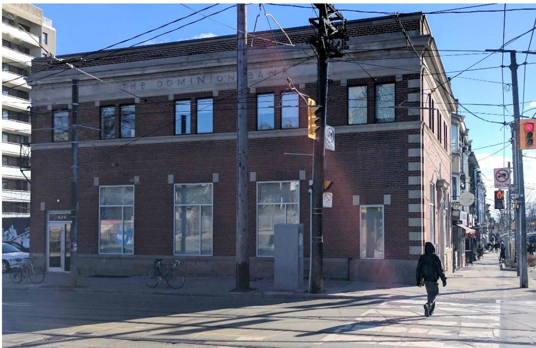
Current photographs of the property at 421 Roncesvalles Avenue showing its context on the southeast corner of Howard Park Avenue (above) and the principal (west) elevation of the Dominion Bank Branch (below)