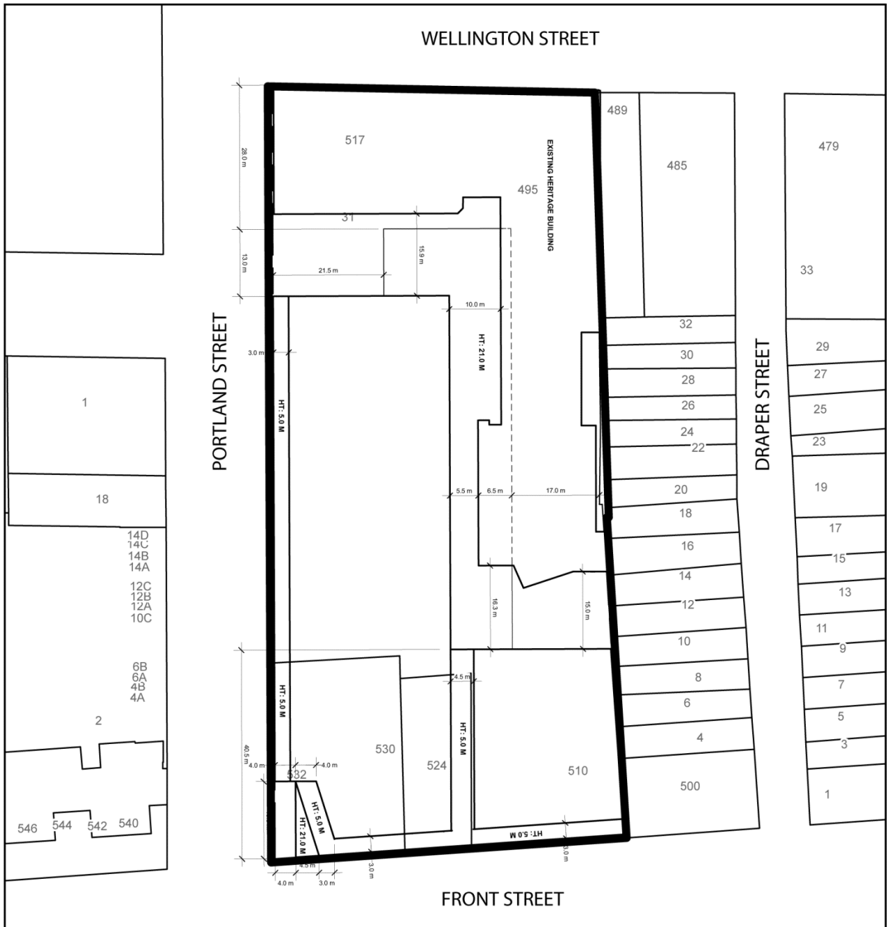
TORONTO Diagram 4

495-517 Wellington Street & 510-532 Front Street West File # 17 256142 STE 20 OZ