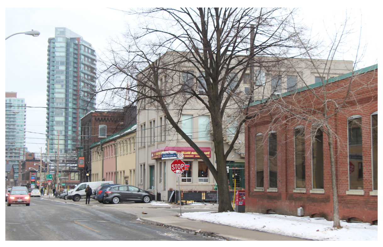
Figure 2: Same vantage point, February 2018 showing 65 Jefferson and 35 Liberty street with a stucco exterior facade.