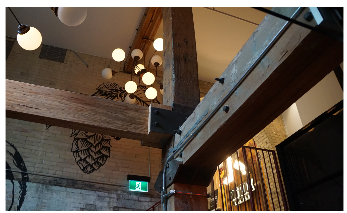
Figure 8: Exposed original post-and-beam framing at the Big Rock Brewery restaurant inside 60 Atlantic, across Liberty Street from the Ontario Wind Engine and Pump Company Building.