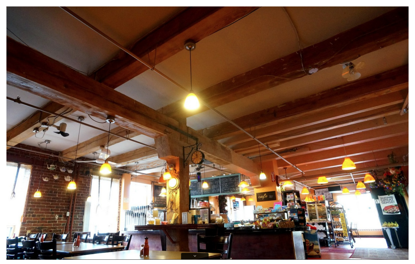
Figure 7: South view inside the ground floor of the Liberty Village Market and Cafe at 65 Jefferson Ave showing the exposed post-and-beam framing. This framing continues intact throughout the upper 2 floors of the building. The original post-and-beam framing is also intact throughout 35 Liberty Street.