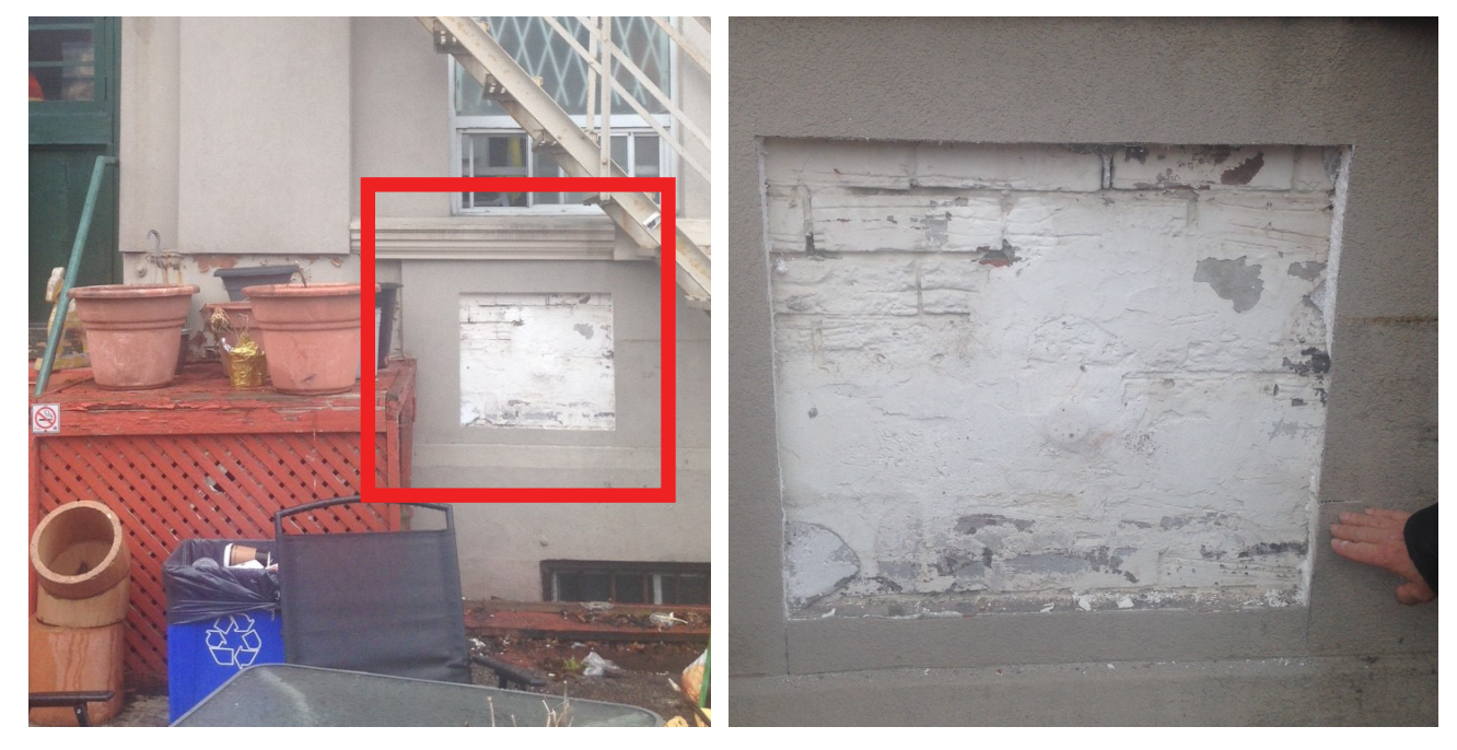
Figure 4: Enlarged details of west facade of 65 Jefferson Ave. with approx. 20" x 20" section of recently removed stucco finish on Styrofoam insulation layer exposing the original brick masonry wall.