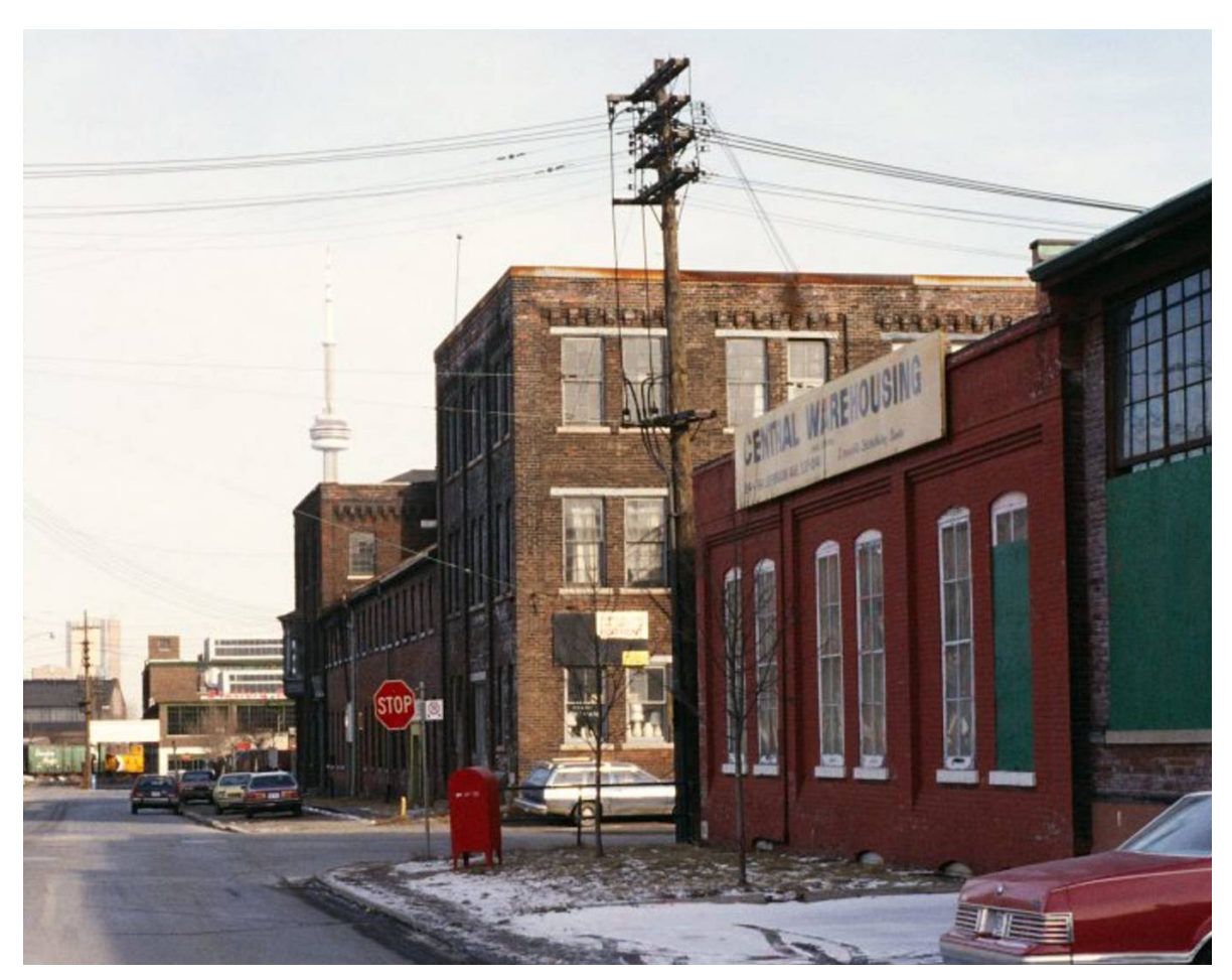
Figure 1: Photo looking east along Liberty Street at Jefferson Ave, c.1980s with all original brick facades intact on 35 Liberty and 65 Jefferson Ave.