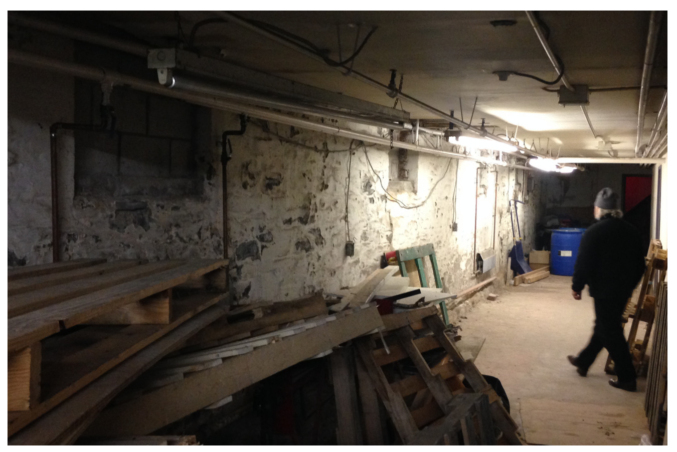
Figure 5: Photo of north basement foundation wall of 35 Liberty along Liberty Street indicating original stone rubble foundation wall. The basement under 35 Liberty Street also contains original fireproof brick arch ceilings and tin counterweight fire doors throughout the basement level.