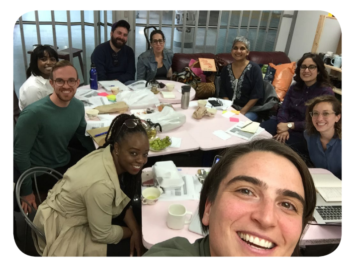
Five of the six artists participating in an introductory session at Tea Base, a cozy community arts space, tucked away in the heart of Chinatown.