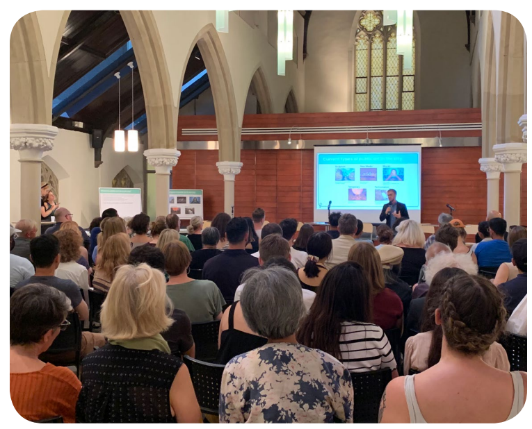
Community Conversation Open House at St. Paul's