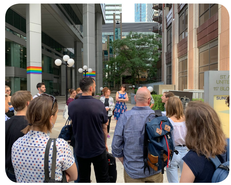
Public Art Walk before the open house

Participants first took part in an art walk led by PROCESS team members and City of Toronto staff. The art walks explored both how public art can and has transformed the public realm within the area. Once returning back to St. Paul's, City staff provided a brief overview of the objectives and process for the public art strategy. After this introduction, a panel of artists and art consultants (see following page) shared their experiences working in public art, and participated in a question and answer period moderated by PROCESS. Afterwards, participants provided feedback on the strategy's draft focus areas, and other insights into their experiences and ideas for the future through different activity stations.