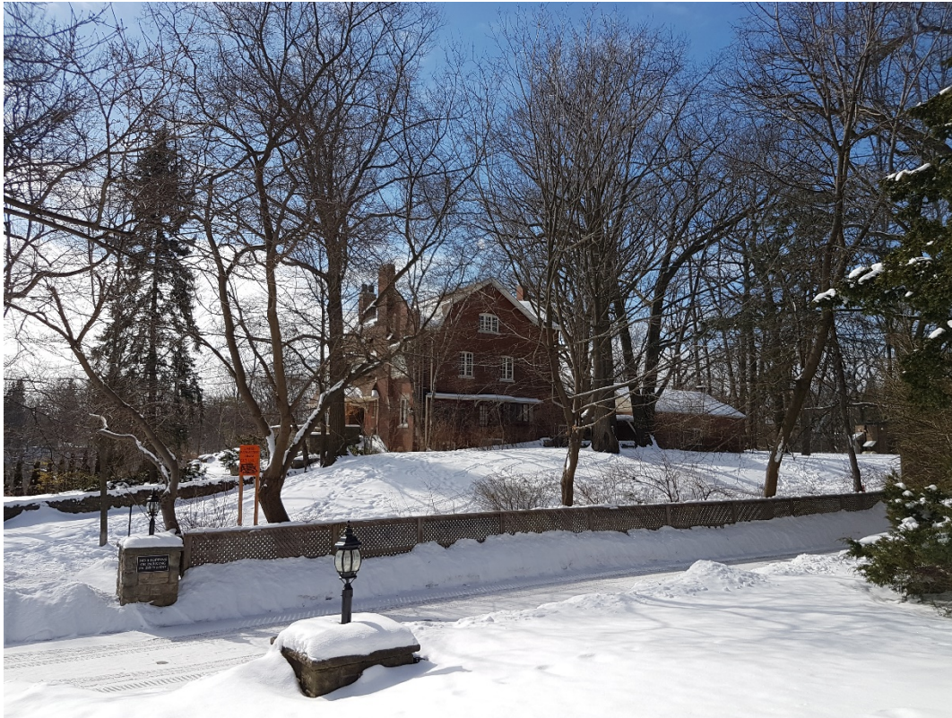
View looking south-west