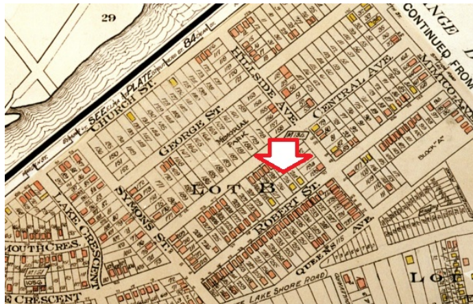
3b. Goad's Atlas, 1924