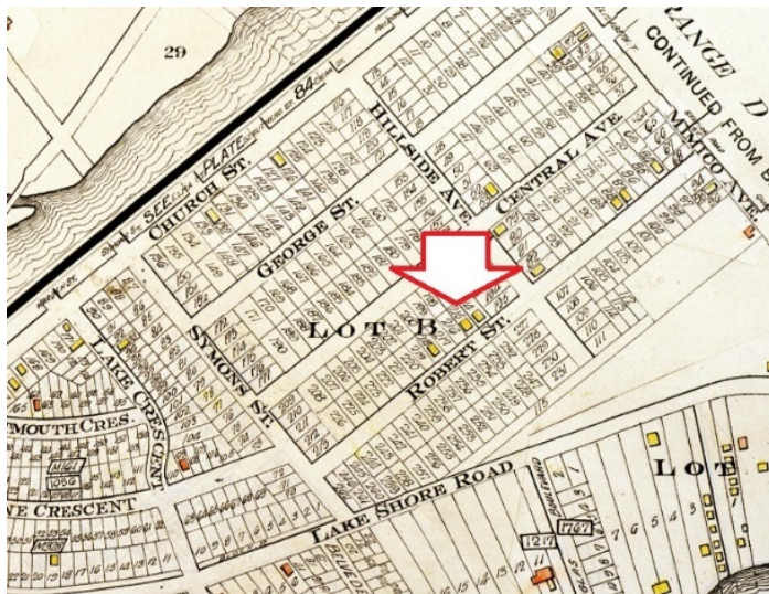
3a. Goad's Atlas, 1913