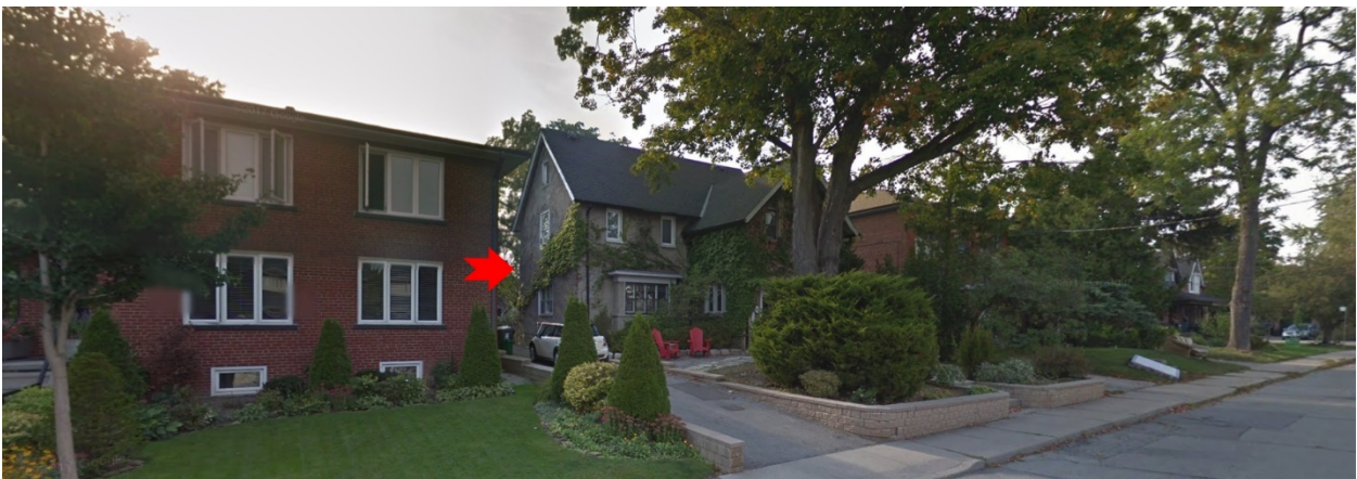
4c. Contextual view, looking north on Wheatfield Road toward Hillside Avenue

4. Current Photographs, 58 Wheatfield Road: Heritage Preservation Services, February 2019, and www.google.ca/maps .