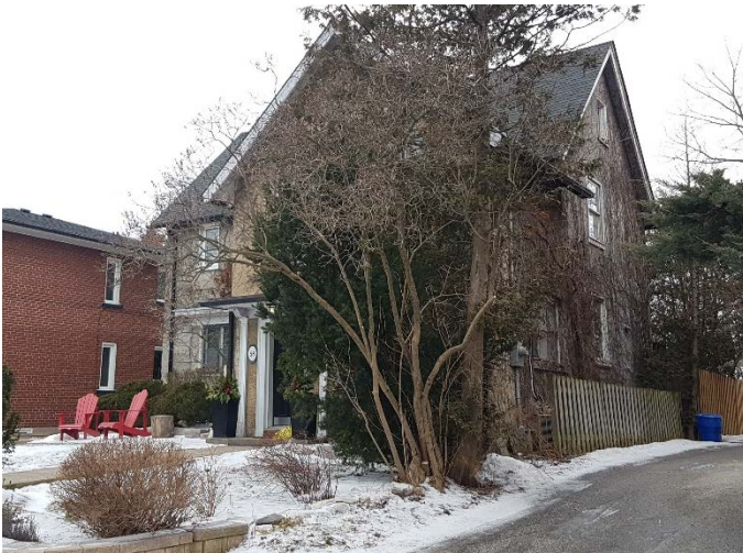
4b. East (left) and north (right) elevations