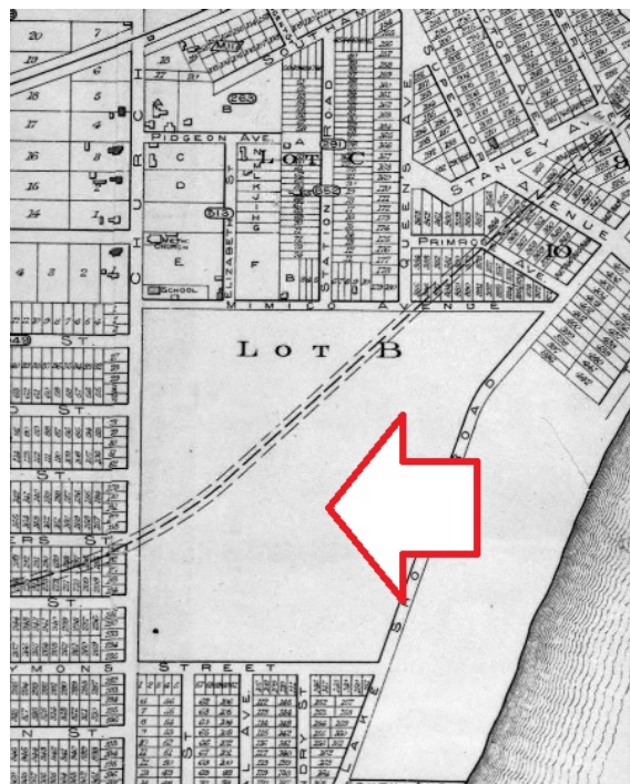
2c. Goad's Atlas, 1890