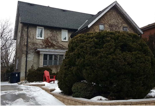
4a. East (right) and south (left) elevations