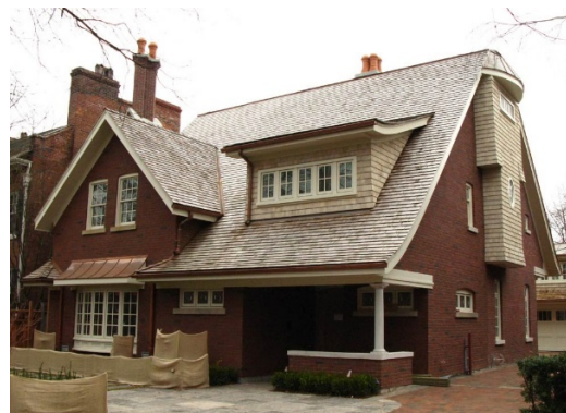
3c. 53 Mimico Avenue, ca 1970s; 3d. 39 Chestnut Park Road, ca. 2016

3. Images: Goad's Atlases, http://oldtorontomaps.blogspot.com/p/index-of-maps.html ; archival photograph, Etobicoke Historical Board; and current photograph, https://www.acotoronto.ca/search_buildingsR.php?sid=13937