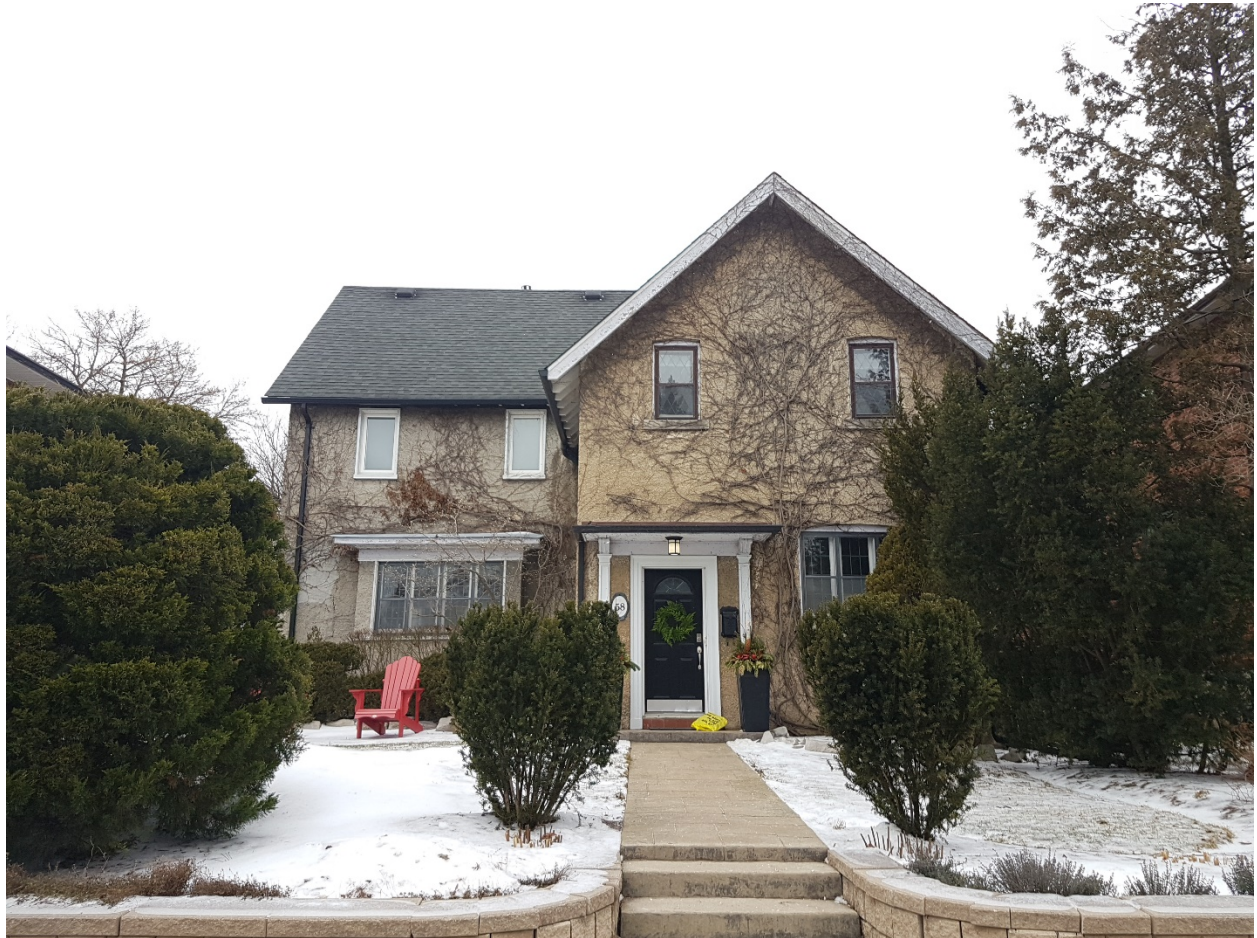
Principal (east) elevation of the Alfred Baker House.