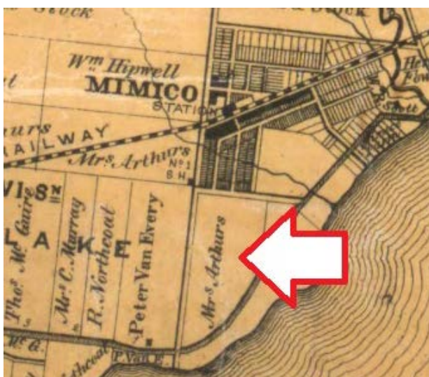
2a. Tremain's Atlas, 1860