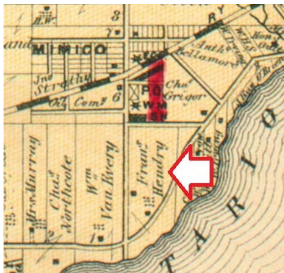
2b. York County Atlas, 1878