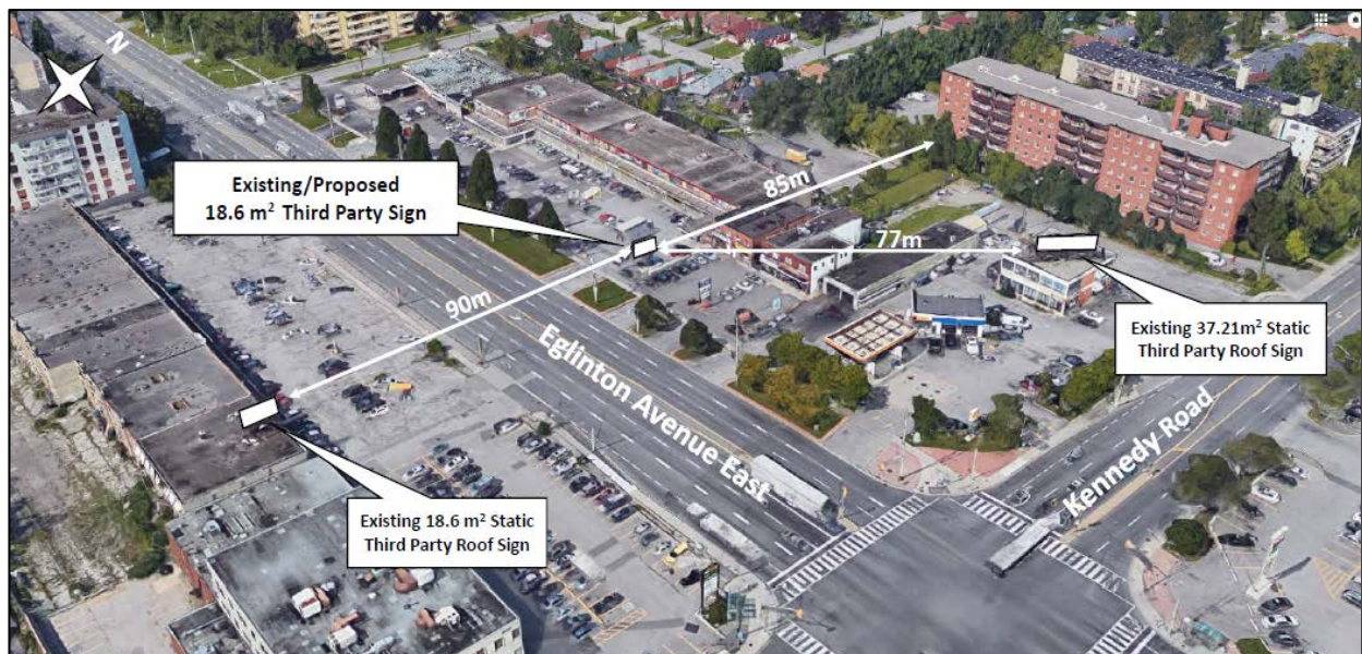
Figure 3 - Aerial Photo of Proposed Sign Location and Distances to Nearby Third Party Signs and Residential Buildings (Distances are approximate)

Although the applicant has proposed shielding which may help to reduce some of the impacts of the electronic copy on residential uses to the north, staff do not believe that the proposed shielding will eliminate all of the impacts of the proposed sign.