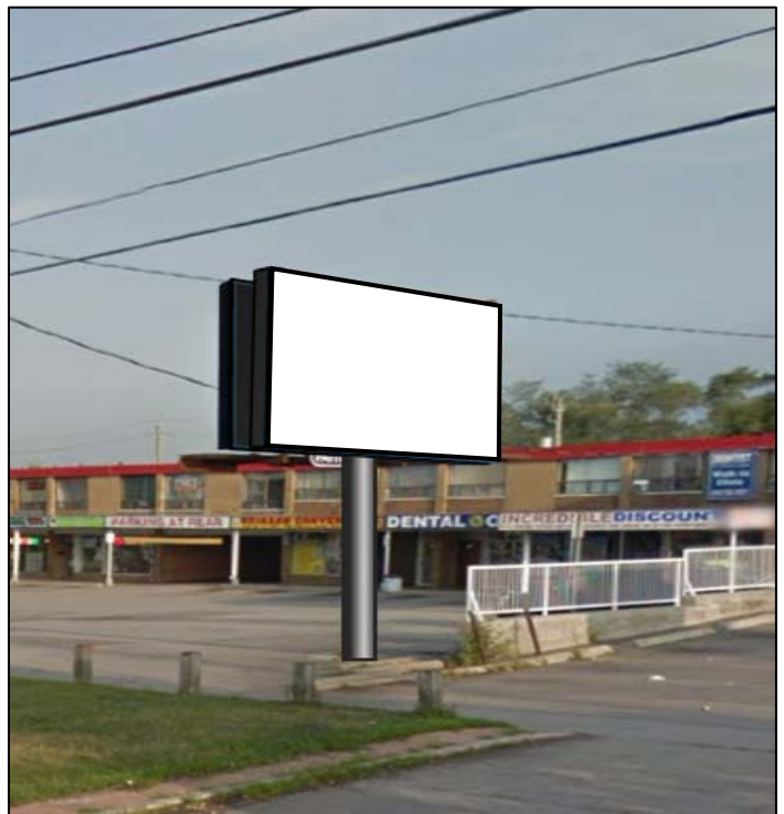
Figure 1 - Rendering of Proposed Sign

The applicant's proposed amendment would also modify the sign permit term of five years, applicable to all third party sign permits, to an initial duration of ten years.