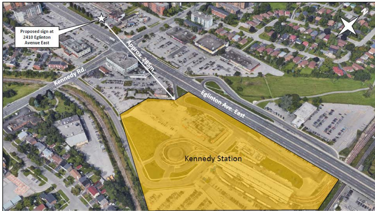
Figure 4 - Proposed Sign Location Relative to Kennedy Station (Distances are approximate)

It is the position of the CBO that the CR Sign District designation and current regulations for the subject property are appropriate, and should not be modified as requested by the applicant.