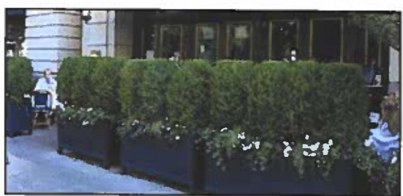
2 PLANTER PRECEDENT A400 NTS

ALL DIMENSIONS SETTING OUT AND LEVELS MUST BE CHECKED ON SITE AND NOT SCALED OFF THIS DRAWING BEFORE ORDERING MATERIALS AND STARTING WORK ON SITE COPYRIGHT LIMEHOUSE STUDIOS INC