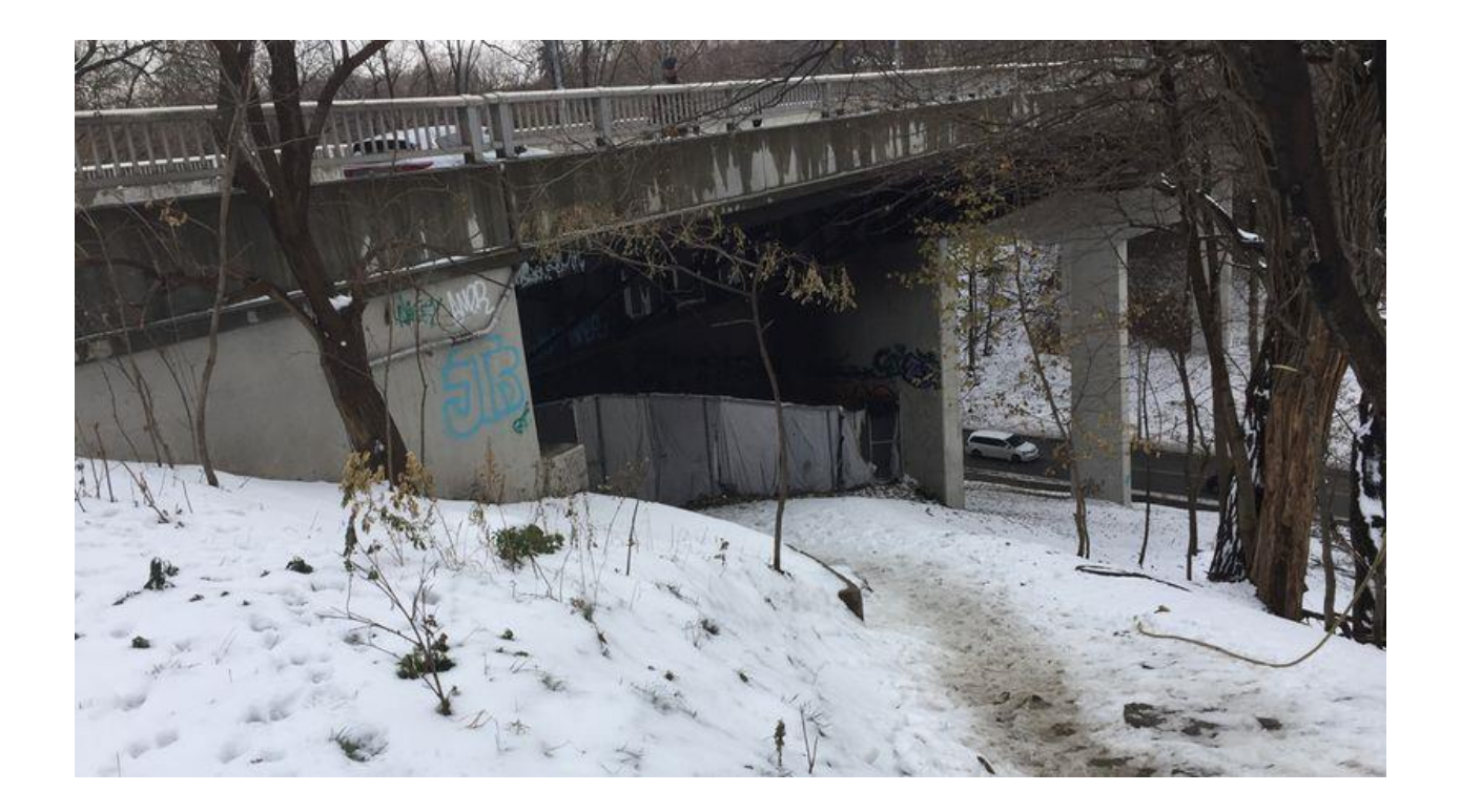
Prior to the Fire taken at the beginning of Dec for follow up to the City.