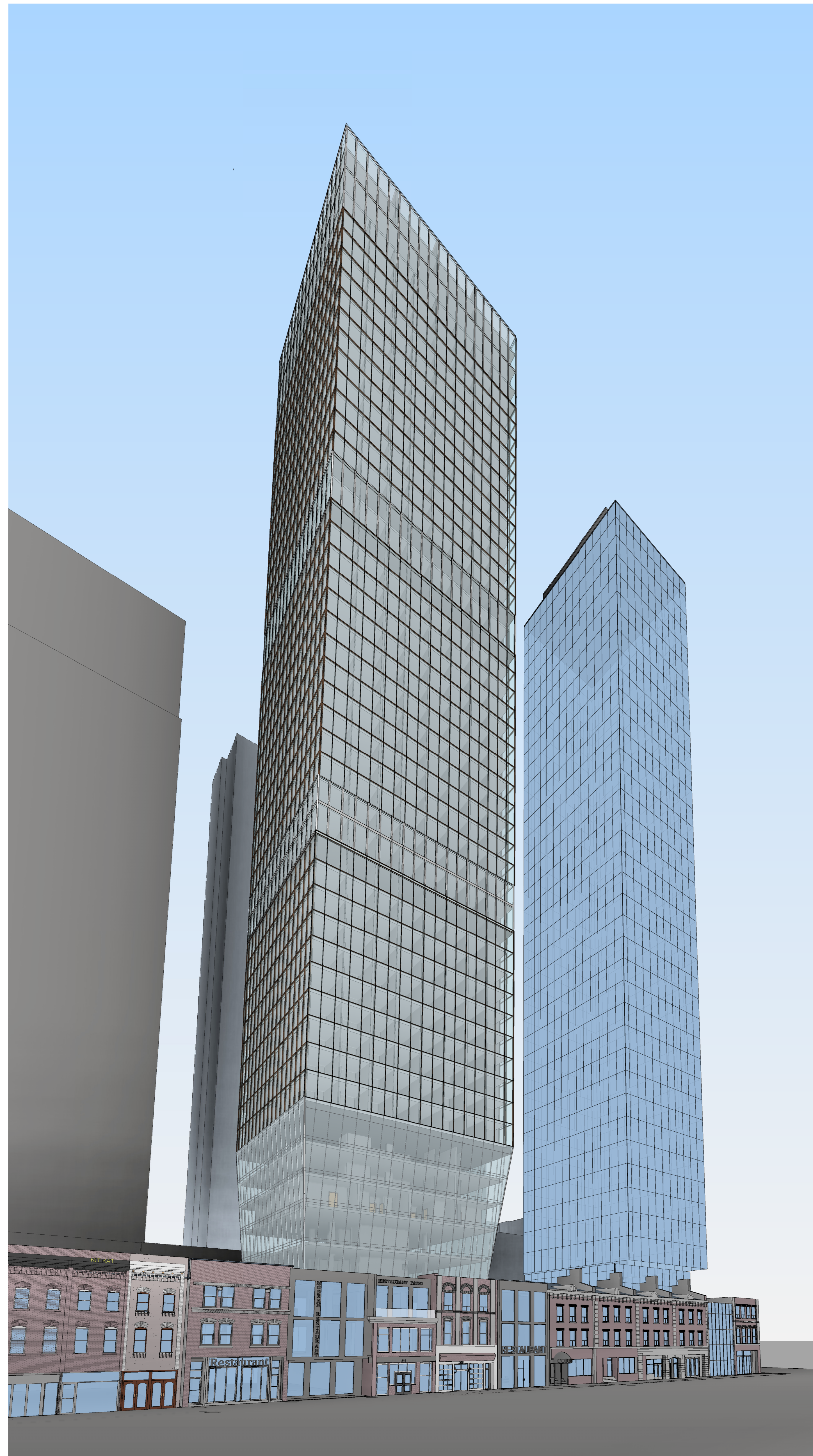
① 3D View 1