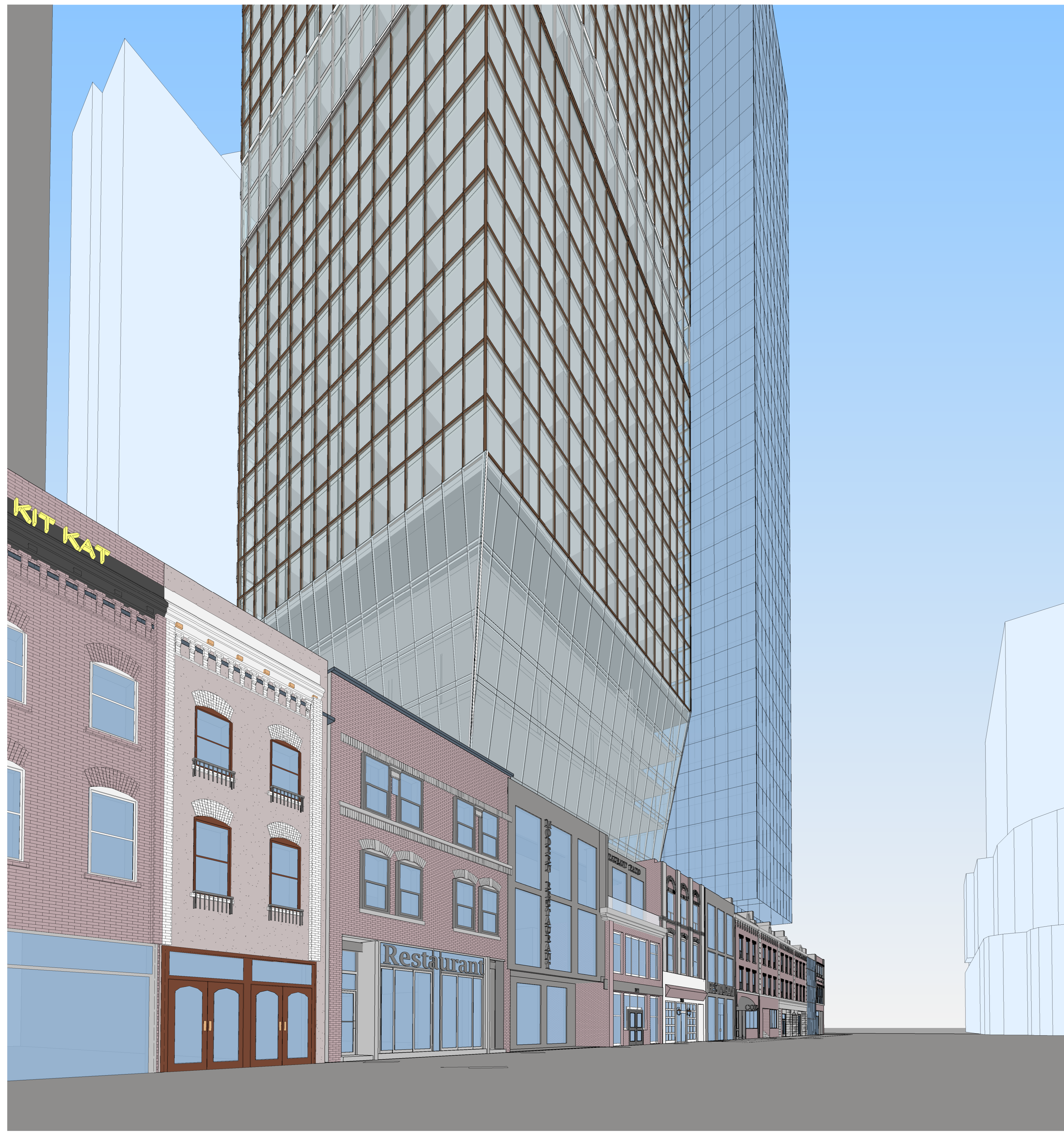
① 3D View 6