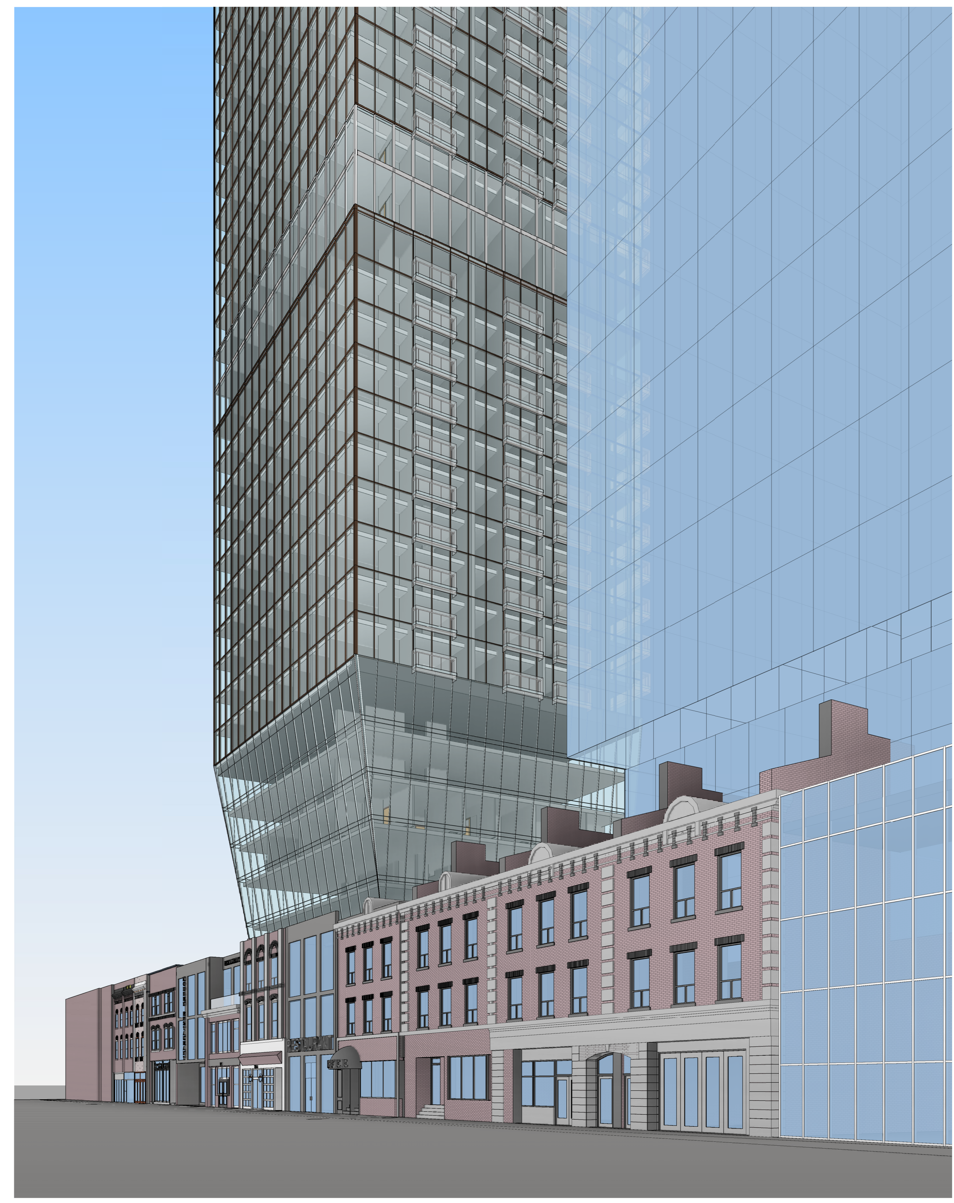
② 3D View 10