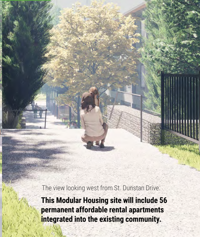
The view looking west from St. Dunstan Drive.

The proposed development will include an east/west path that connects through to St. Dunstan Drive.