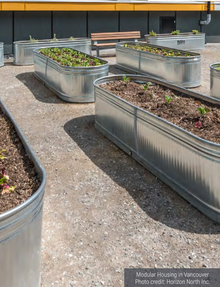
Modular Housing in Vancouver