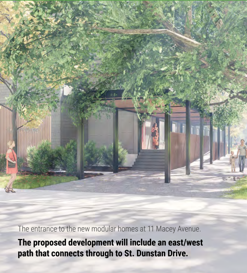
The entrance to the new modular homes at 11 Macey Avenue.

The proposed development will include an east/west path that connects through to St. Dunstan Drive.