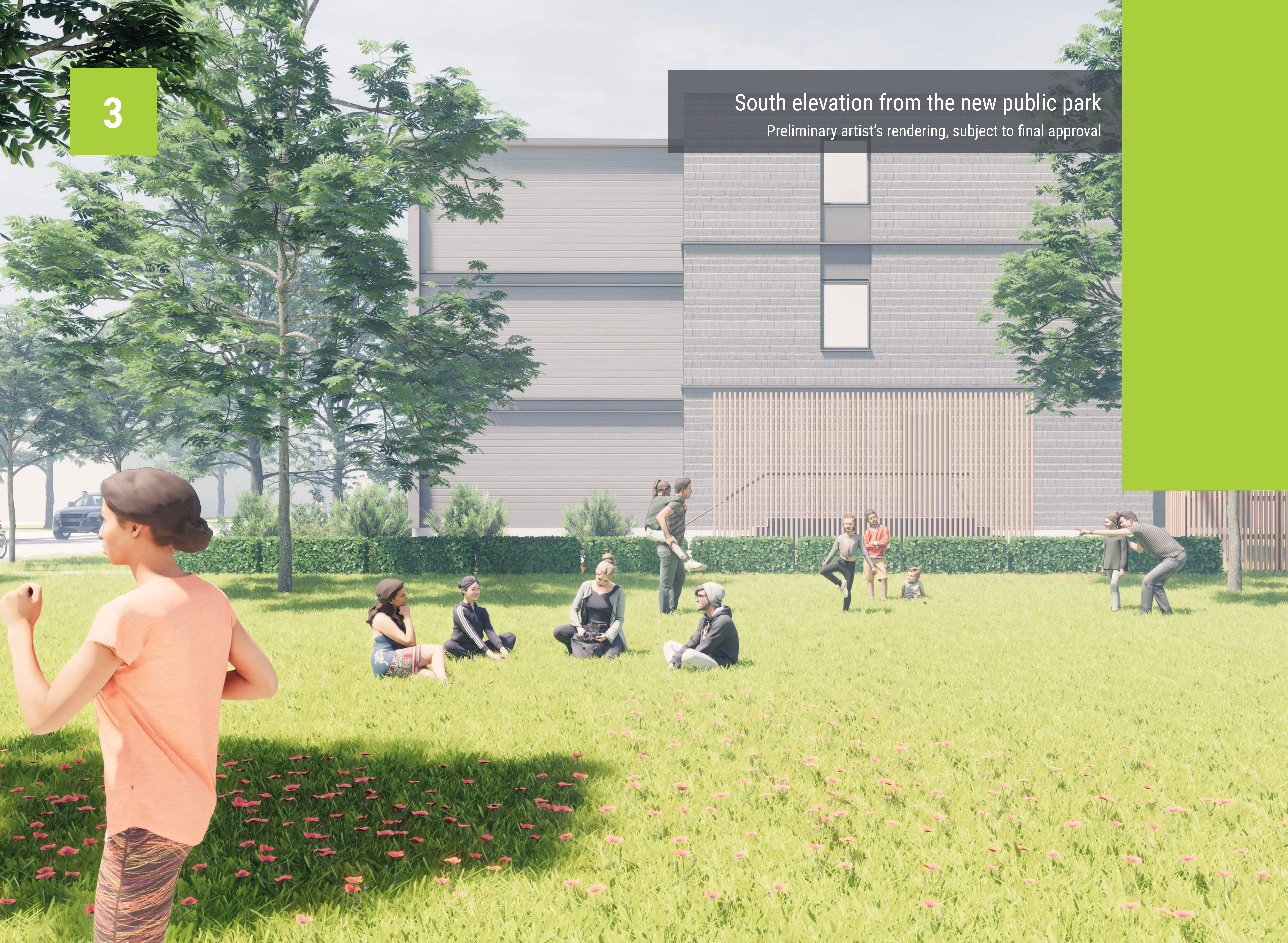
Looking north in the Dovercourt Road setback Preliminary artist's rendering, subject to final approval