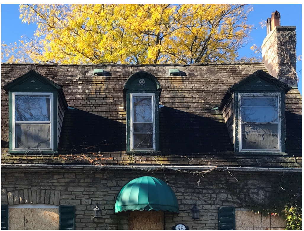
8. Current photograph of 98 Superior Avenue showing the neo-classically inspired dormer window roofs. Note: at the time of writing this report, the property has been boarded up. (Heritage Planning, 2020)