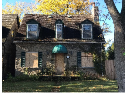
[Left to right]: Photos of the properties at 214 Queens Avenue, 96 and 98 Superior Avenue showing the principal (east) elevations (Heritage Planning [HP] 2020)