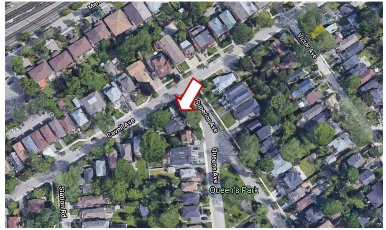
Aerial image of the three properties at 96-98 Superior Avenue and 214 Queens Avenue