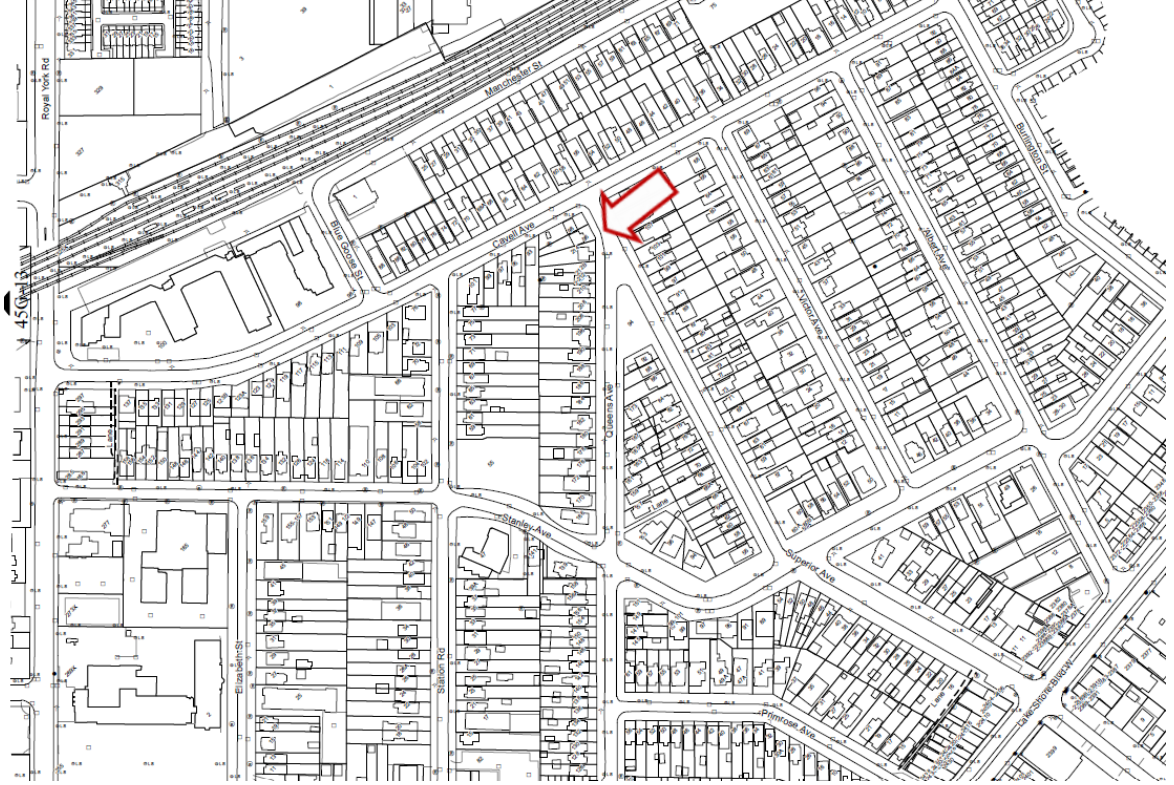
1. This location map is for information purposes only; the exact boundaries of the properties are not shown. The arrow marks the site of the properties at 96-98 Superior Avenue and 214 Queens Avenue (City of Toronto, I-View Map, 2020)

Please note: all maps are oriented with north at the top, unless otherwise indicated