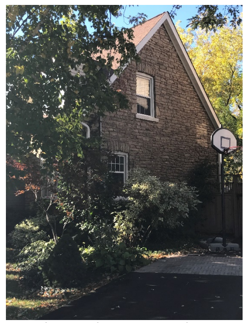
10 and 11. Current photographs detailing the fine craftsmanship of the stonework on all three cottages with the stone (allegedly locally sourced from Mimico Creek) being used on all four elevations and decorative detailing employed for the lintels of all openings in the form of stone voussoirs and keystones. (Heritage Planning, 2020)