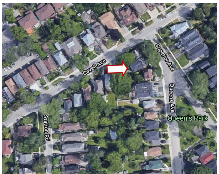
9. Birdseye view showing the three subject properties. The arrow indicates an addition to the rear of 96 Superior Avenue