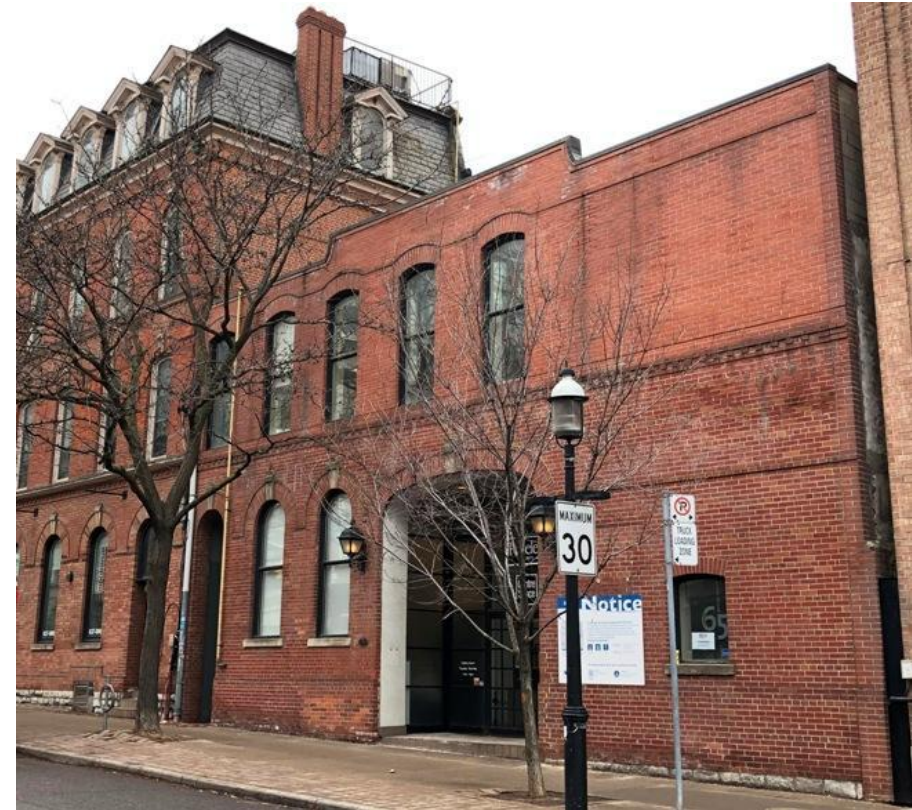
Photographs of the former Little York Hotel, 1879 (left) at 187 King Street East and the Little York Hotel Carriage House and Stables, 1880 (right) at 65 George Street (Heritage Planning 2020)