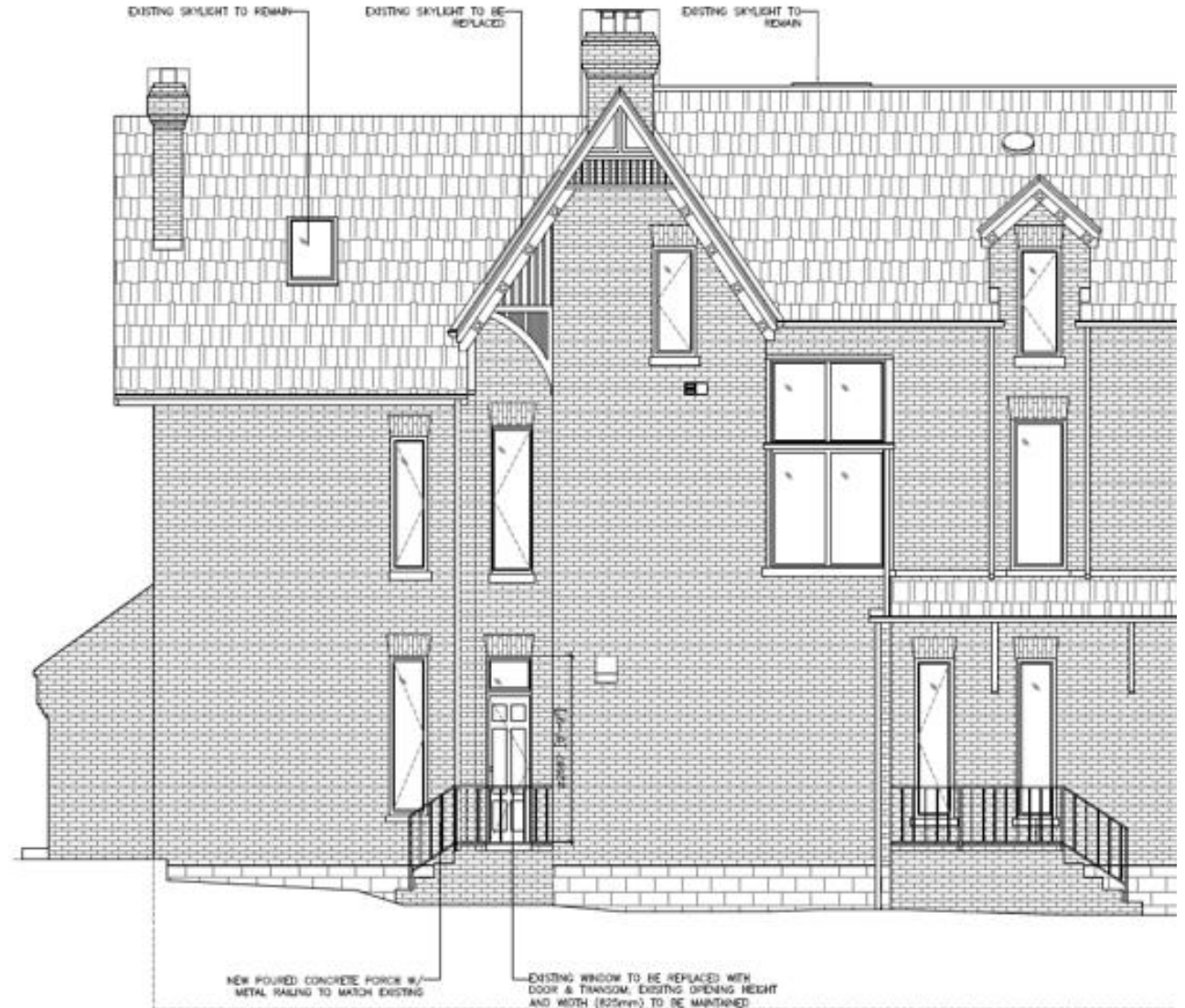
View of existing north elevation facing Bernard Avenue (left) with proposed alterations (right)