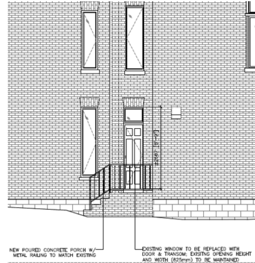
View of proposed alterations facing Bernard Avenue, full elevation (left) and zoomed-in (right)