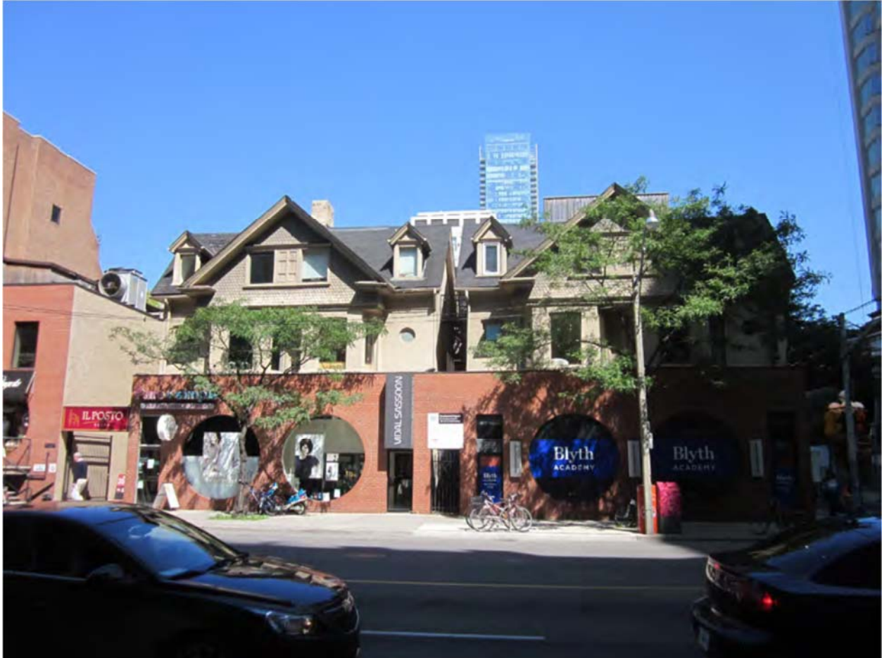
33 Avenue Road - West Facades of Victorian House form buildings. Note 1960s ground level interventions