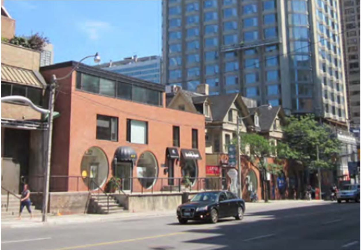
At the Avenue Road frontage, north portion of the site