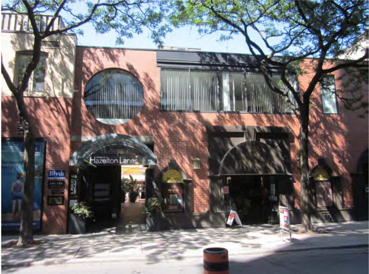
South Façade at Yorkville Avenue. 1960s buildings and its interface with the heritage house form.