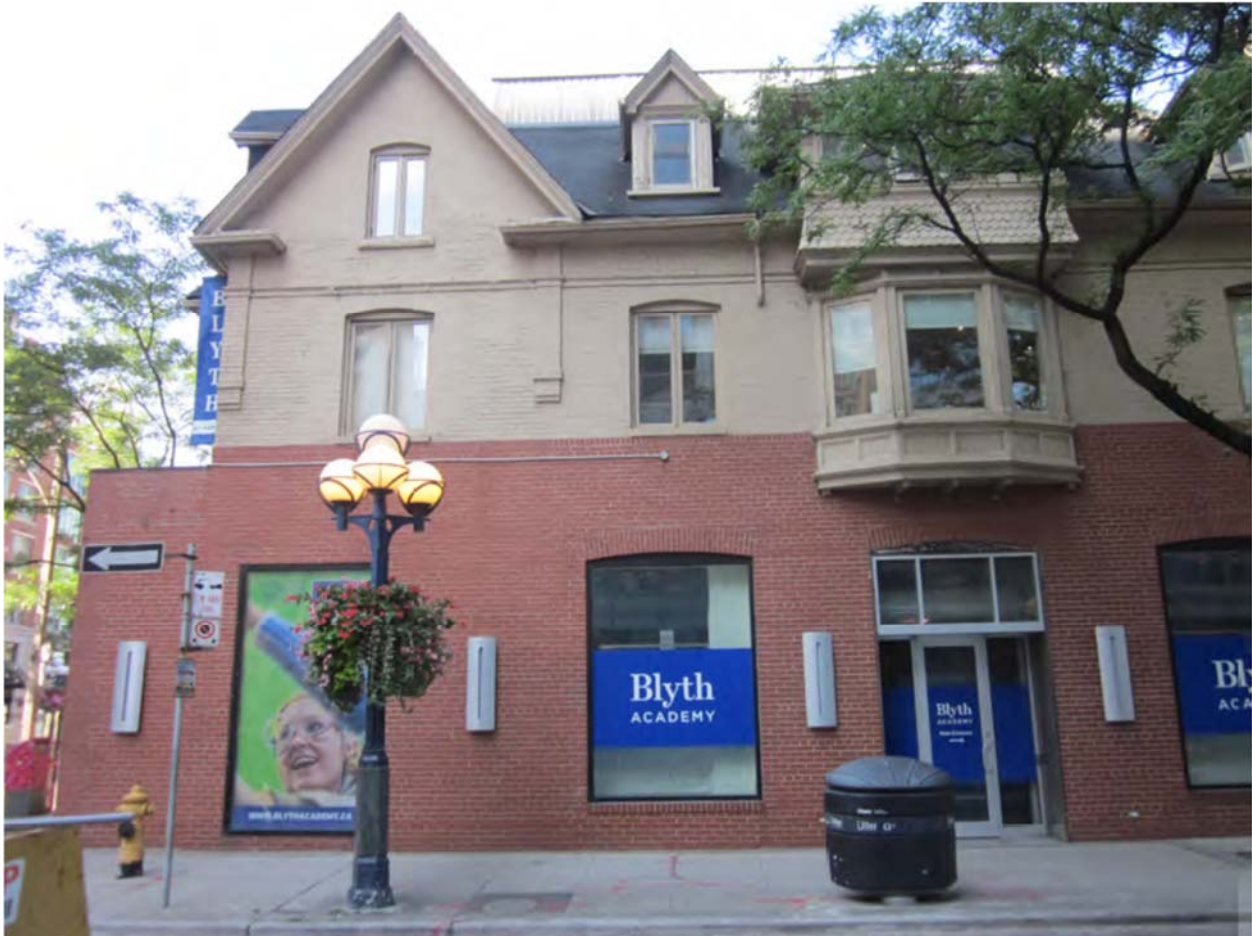
33 Avenue Road - South Facade of Victorian House form building at Yorkville Avenue frontage. Note 1960s ground level interventions