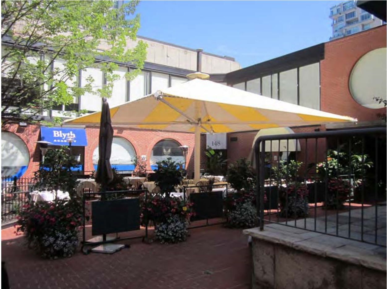
Internal Site - Existing York Square with surrounding 1960s structures