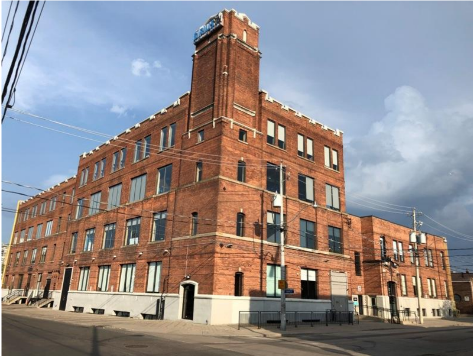
E. W. Gillett Co. Ltd complex, a Liberty Village landmark at the south-east corner of Fraser Avenue and Liberty Street