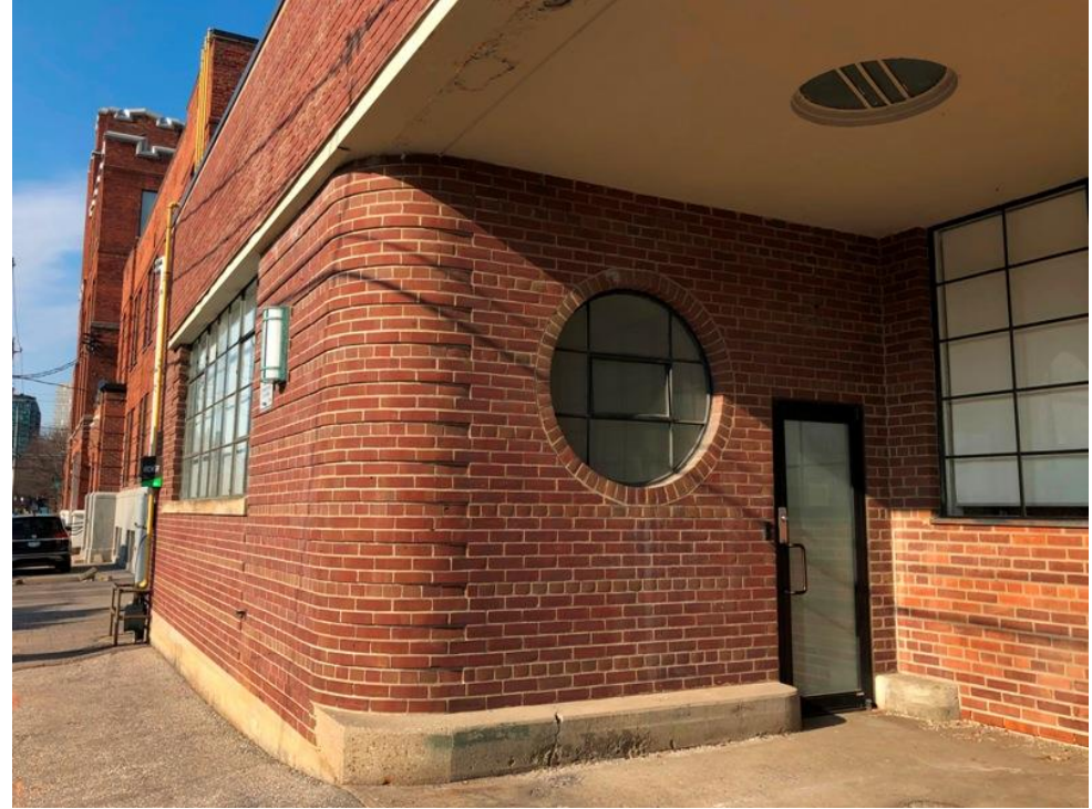
Garage/Storage Building, 41 Fraser Avenue (left and right)