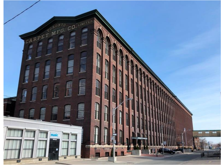
Liberty Village Context, showing a selection of the early 20 th century industrial buildings at 29-37 Fraser Avenue (above), 58 Fraser Avenue (centre, bottom), 99 Atlantic (centre, top) 67 Mowat Avenue (right, top) and 60 Atlantic Avenue (right, bottom)