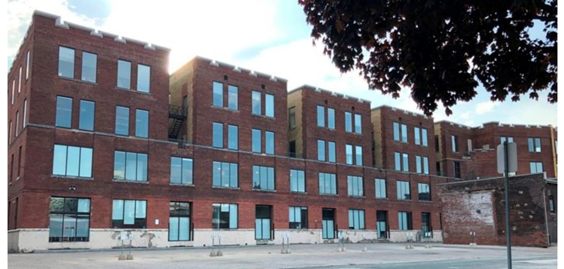
Photographs of the factory building at 135 Liberty Street and 53 Fraser Avenue showing the north and west facades with the adjacent office building (left), east and north facades (top, right) and east façade (bottom, right)