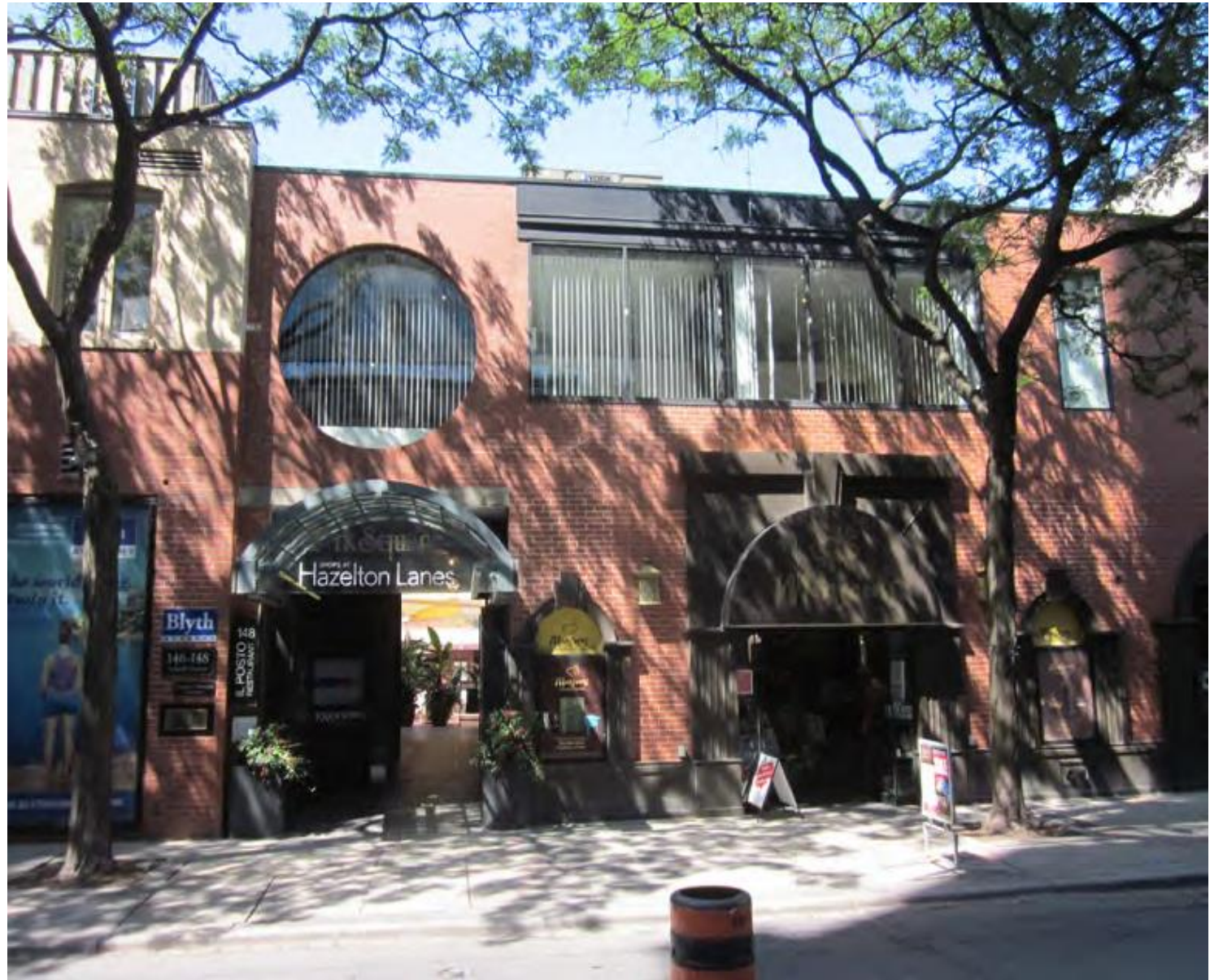
South Façade at Yorkville Avenue. 1960s buildings and its interface with the heritage house form.