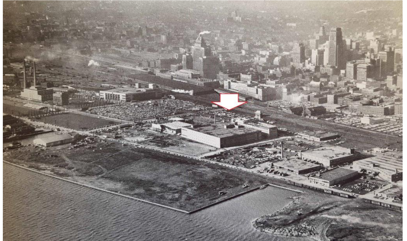
View of 55 Lake Shore Boulevard East in the 1950s