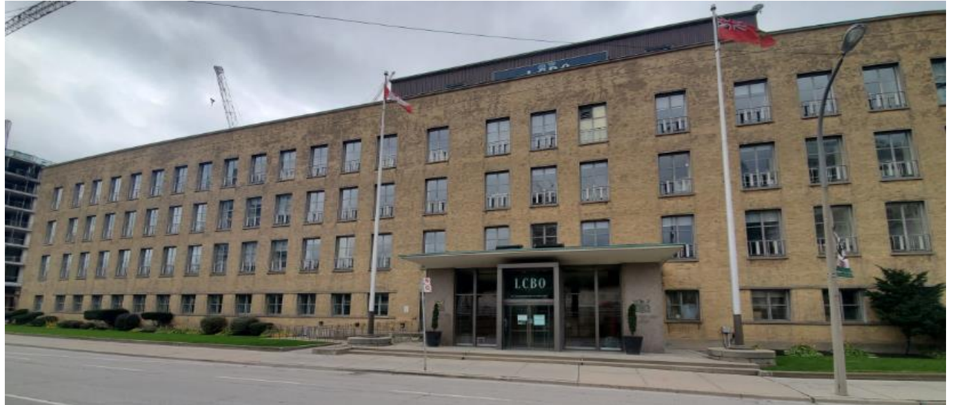
Details of the north elevation of the Office Building