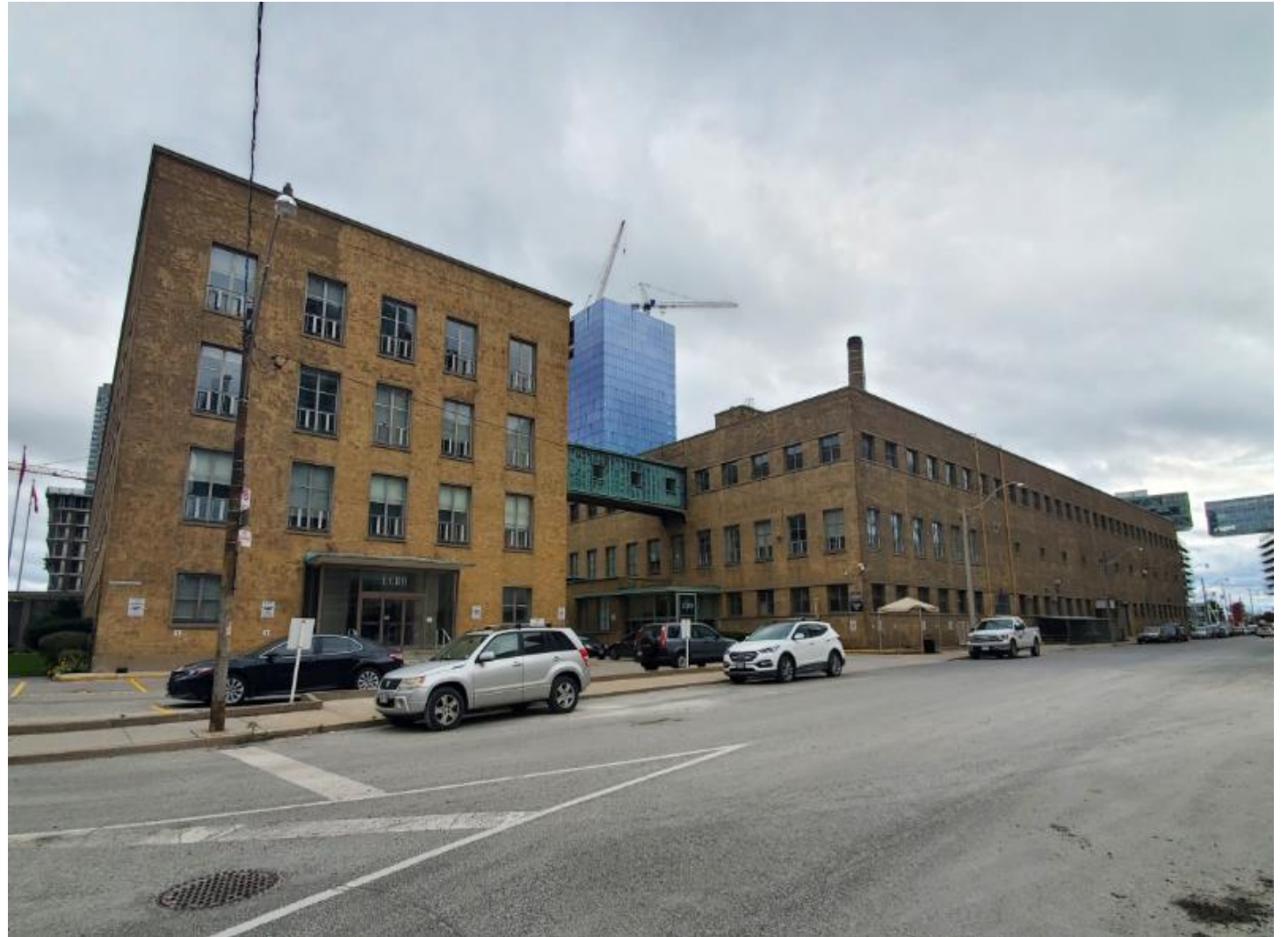
Detail of the west (side) elevations of the LCBO Office Building (left) and the Warehouse (right)