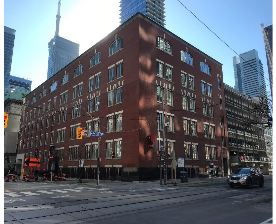
Photos of the property at 100 Simcoe Street (Rolph and Clark Limited Building, showing the 1904 south section and east elevation along Simcoe Street (top), and the 1905 north section adjoining Adelaide Street (bottom) (Heritage Planning, 2020)