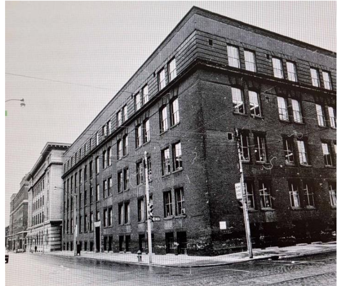
Archival Photographs: 100 Simcoe Street, 1973: showing the complex following the removal of the cornice and before the addition of the fifth storey