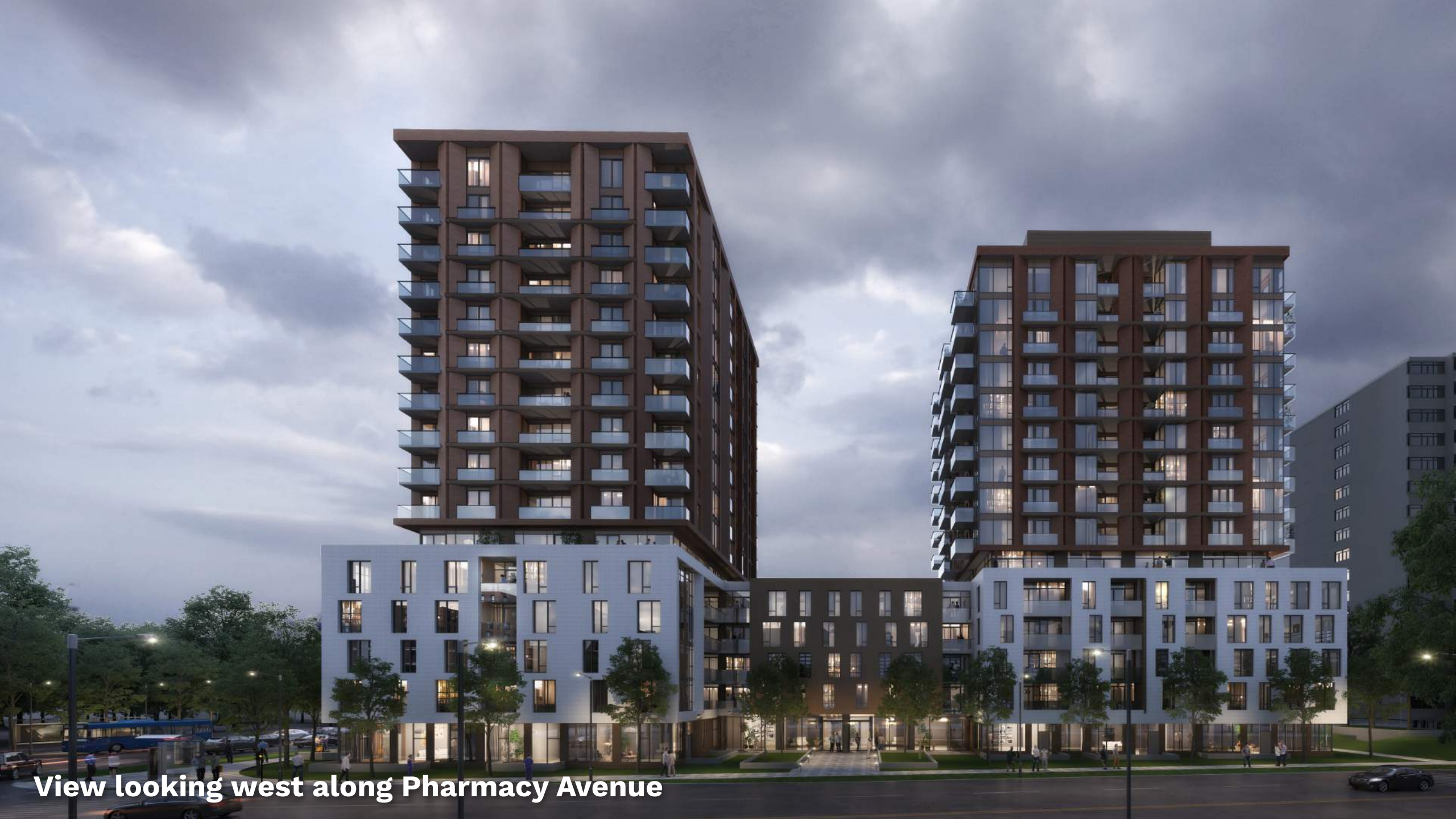
View looking west along Pharmacy Avenue