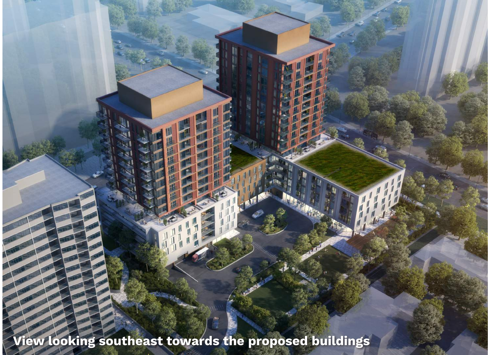
View looking southeast towards the proposed buildings