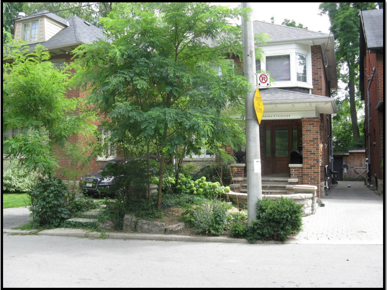
Frontage of 75 Poplar Plains Crescent (1)