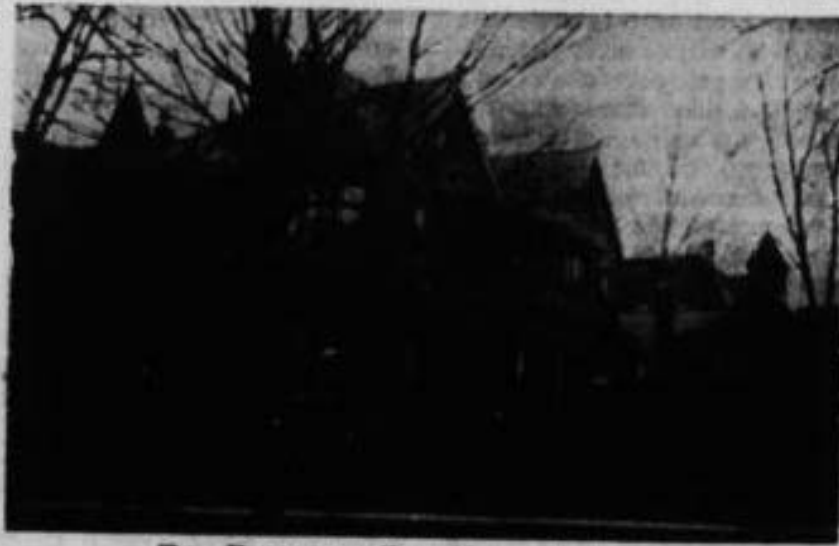
THE ELIZABETH RYE HOME, TORONTO.

Described as a real home, with bright airy rooms, the building is of three stories with large verandahs. On the ground floor there are assembly rooms, dining-room and kitchen; the first floor contains dormitories, special rest rooms and matrons' rooms, and there are dormitories again on the second floor.