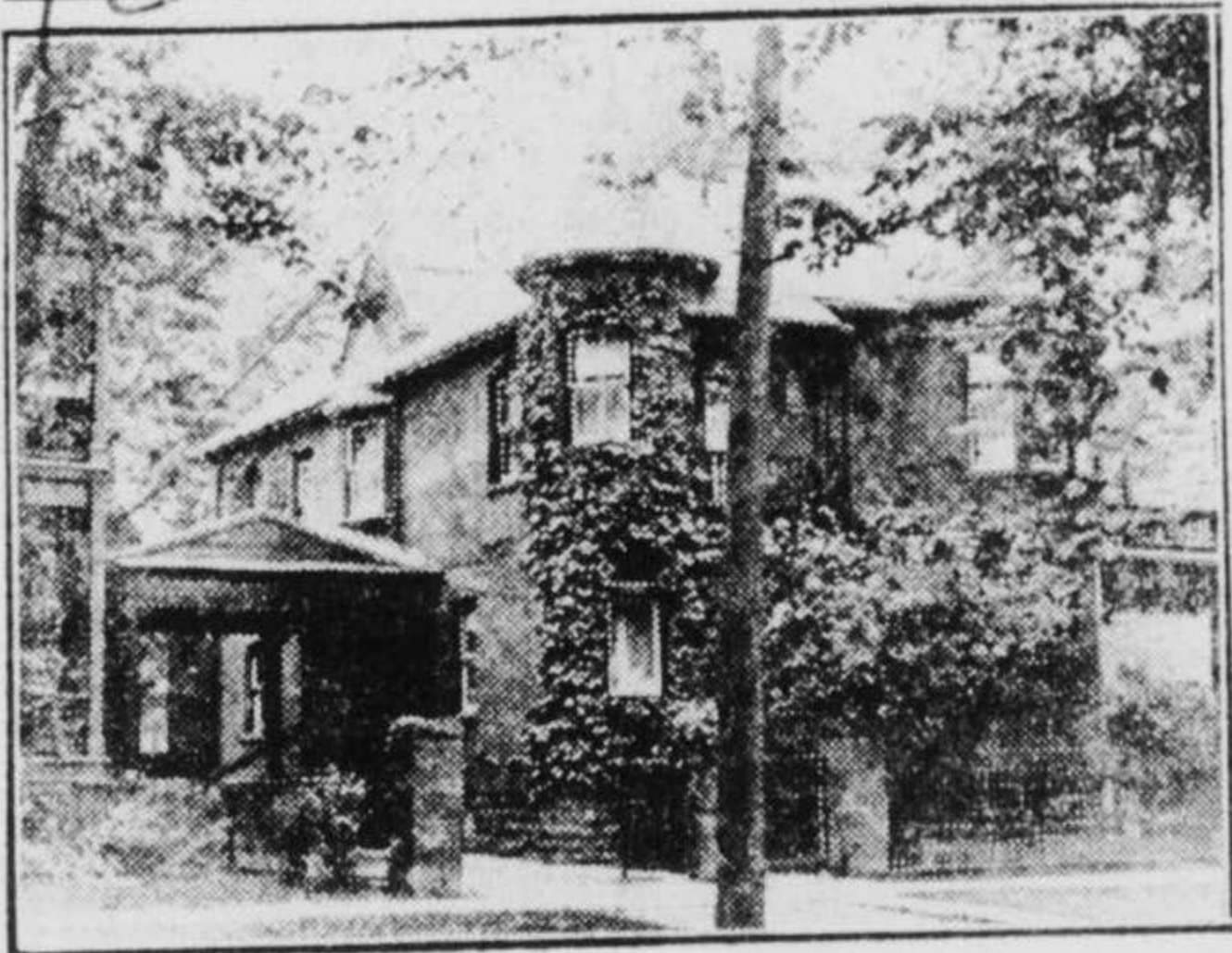
The new centre for English domestic girls at 661 Huron street

A Cordial Invitation is extended to you and your friends to attend the Dedication of the Church Hostel for Girls at 661 Huron Street by the Lord Bishop of the Diocese on Tuesday, October 7th, 1924 at 3.00 p.m.