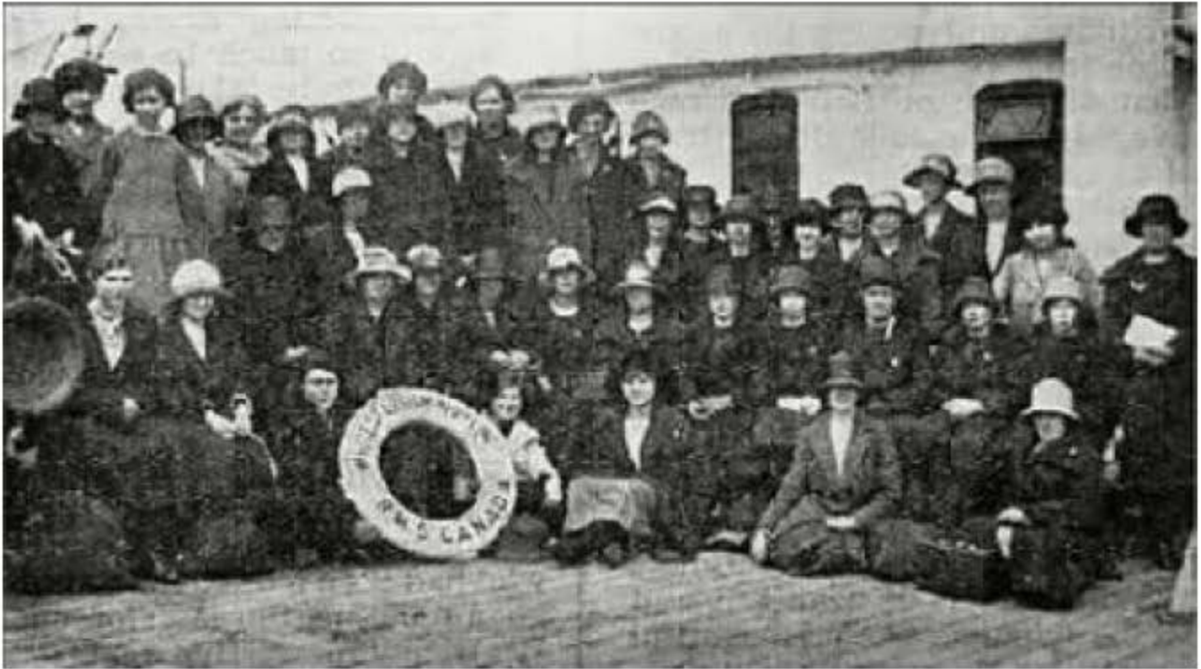
June 1924 girls headed to Huron Street in Toronto The girls in this photo include: