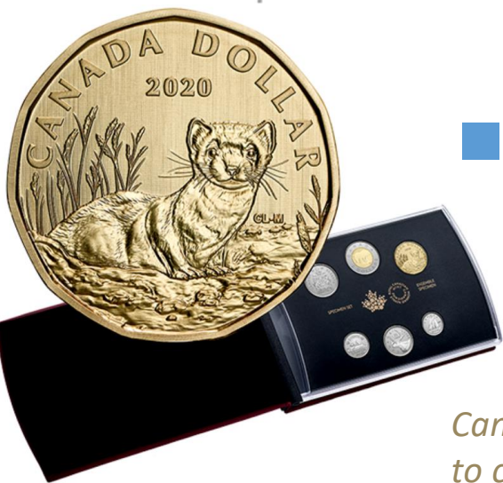
Canadian Mint/Wildlife Conservancy partnership to create a black-footed ferret coin set