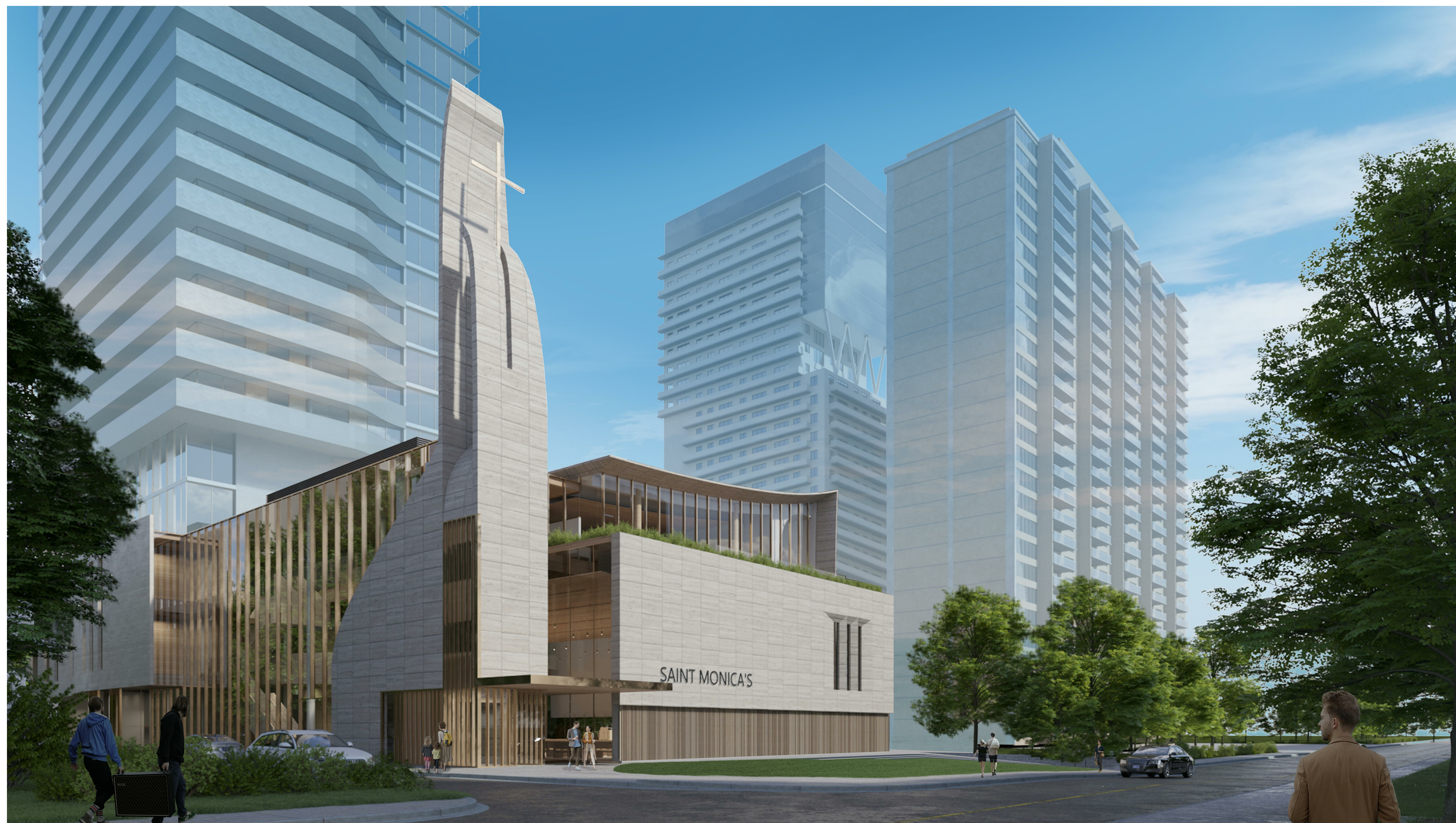
BROADWAY AVENUE VIEW FROM SOUTHWEST